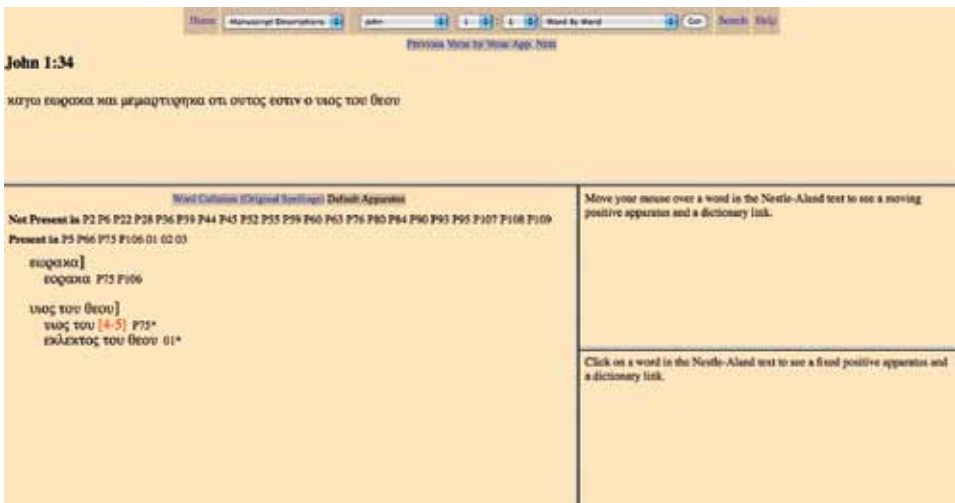
Nestle-Aland 28 Online Prototype: 1st October 2009

In October 2009, the website page looked like this: