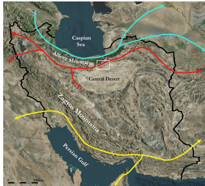
Figure 1. Migratory pathways on the Iranian Plateau (reproduced from Vahdati Nasab et al. 2013)

regarding Paleolithic occupations and no Pleistocene cave or rockshelter was documented before such investigation. Northern margin of the Iranian Central Desert joins the southern piedmont of the Alborz with a very steep slope in Semnan and Mehdishahr counties, which are located 15-30 km from open air Paleolithic sites (Figure 2). Within such a short distance the elevation rises from c.1000 masl in the south to c.2500 masl in the north, resulting in an ecologically varied landscape in the region (Figure 3).