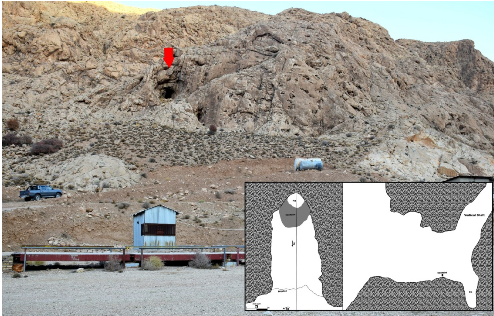
Figure 5. Anzo cave entrance near the quarry facilities (view from the southeast) and cave plan and section with the location of the clandestine pit

end of the cave reveals c. 2m of deposits (Figure 5). The chipped stones collected from the surface of the slope outside the cave include a bidirectional core, a flake apparently made by levallois technique, a plunged debitage from unidirectional mixed core, a flake/blade segment and 2 flakes (Figure 6).