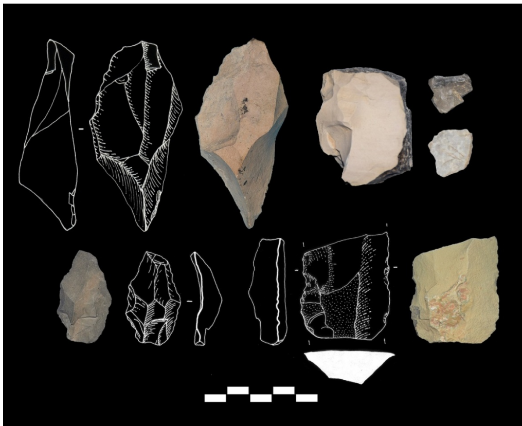
Figure 6. Chipped stones from surface collection of Anzo Cave