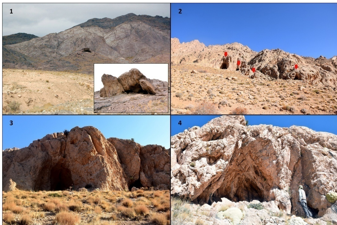
Figure 4. Caves and rock shelters recorded in Mehdishahr region which failed to yield Paleolithic finds (1. S1701; 2. Litho Rock Shelters complex (S1708-S1711); 3. S1711; 4. S1708)

As a result, 12 caves and rock shelters were recorded, despite the promising condition of which only one had evidence of Paleolithic occupation. Due to the importance of recording all background information and observations made during the course of the survey, even those caves and rock shelters which failed to yield Paleolithic finds were recorded (Figure 4).