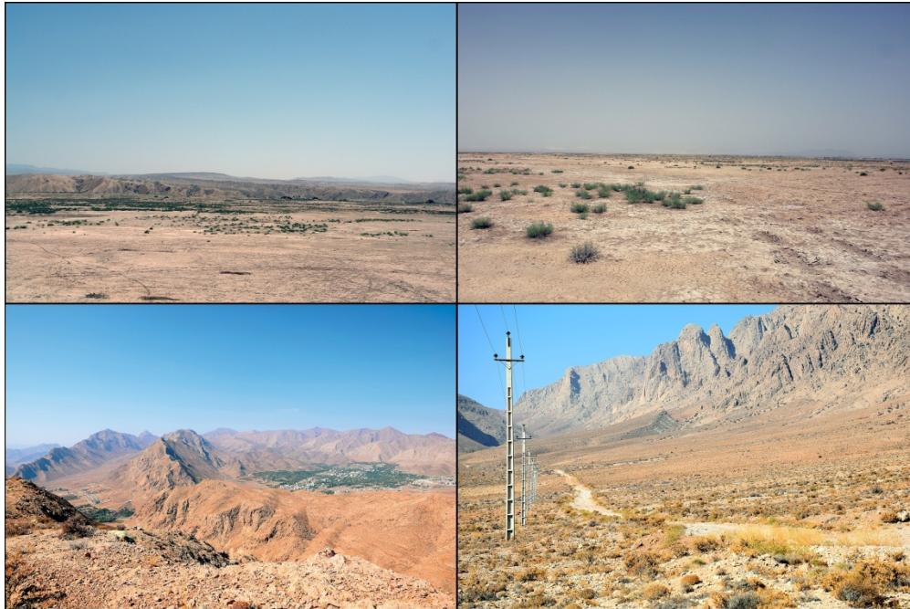
Figure 3. Various ecological landscapes in the southern piedmont of the Alborz Range and the northern edge of the Central Desert