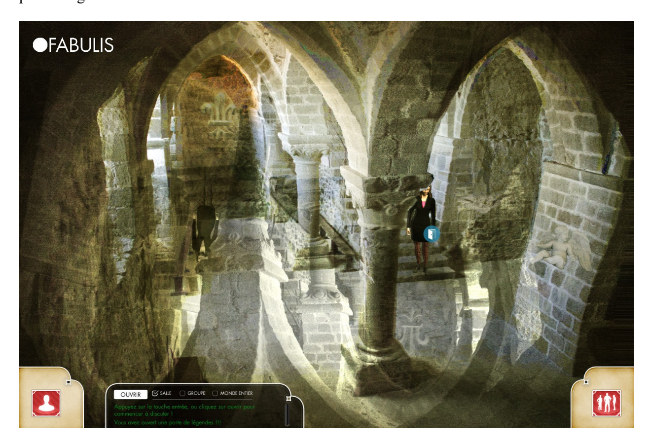
Figure 2. Screenshot from the game OFabulis, legendary world of the Mont-Saint-Michel, Lelievre, online, 2014.

(Figure 2), I tried to examine the creation process of video games to promote cultural heritage: "One may wonder whether there is a specific creation process when it comes to video games promoting historical monuments."