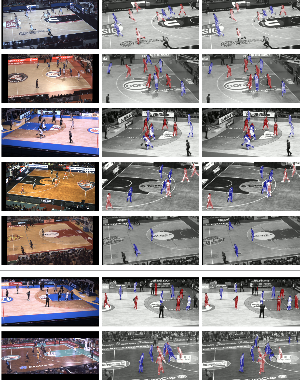
Figure 2: Team discrimination with associative embedding. From left to right: test image, zoomed reference masks and prediction. The first five rows present success cases, while the last two show failure cases. From top to bottom: running players; strong shadows; occlusions; court and teams share the same colors; only one team; confusion between players and referees; extreme occlusions. Please refer to the numerical version of the paper for the colors and ability to zoom on details.