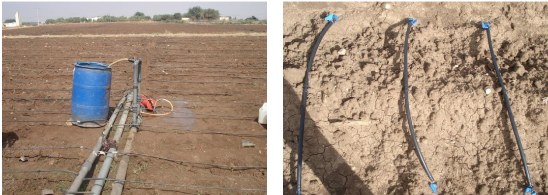
FIGURE 2.2 Widespread adaptation of drip by Moroccan farmers

Many farmers have also inserted small valves on each of the lateral lines instead of a single large valve on the secondary pipe (Figure 2.2). This allows them to direct water to parts of their field as needed instead of watering the whole area at once, which helps them to cope with uneven terrain and to manage mixtures of crops in the same field that have different growing seasons.