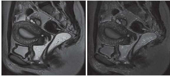
(a) Ground truth high-resolution MRI (b) Ground truth US image without Rayleigh noise obtained using a polynomial function applied to the MR image in (a).