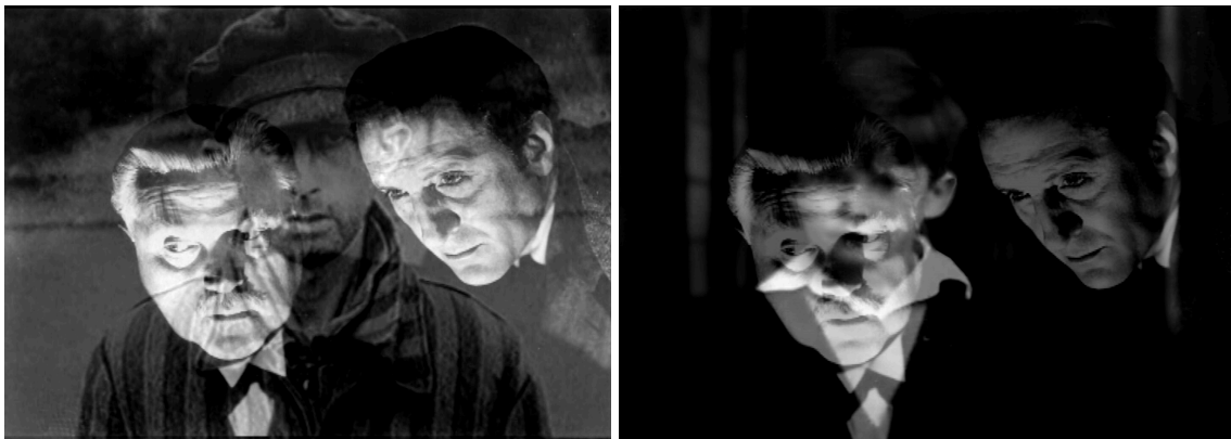
Figure 1. Superimposition between historical reality and fiction. Figure 2. Superimposition between fiction and childhood experience. La Morte Rouge (Victor Erice, 2006). Nautilus Films.

At this moment, the cross-fade becomes the first rhetorical element of this process of indiscernibility. It materialises the shift of fear from fiction to historical reality, that of the Spanish postwar period and the Second World War: ‘for the public The Scarlet Claw was mainly just one more scary film. Except that, in this instance scariness spread forth beyond the screen, prolonging its echo in the ambience of a devastated society.’ Again, the documentary image of the essay film evokes and invokes the fictional creation of The Spirit of the Beehive . What for the adult individual is a leisure activity through which to manage the fear imposed by reality, for the boy, still unaware of the differentiation between fiction and reality, becomes trauma. The cross-fade used between the previous frames is now slowed down to cause the superimposition, and to produce a symbolic sentence-image of it: superimposition between the horror of Nazism and the terror of fiction [Figure 1] and superimposition of that same fictional fear on the face of the boy who will not be able to differentiate them [Figure 2]: ‘Did this universal pain somehow weigh upon the heart of the five-year-old boy who, in the company of his sister –she was seven years older– walked towards the penumbra of a cinema, to see the first film of his life? It is difficult to know.’