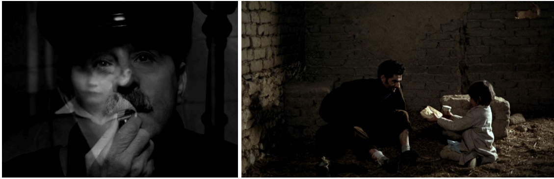
Figure 5. Superimposition between the real imagen of the boy and the fictional recreation of the postman in La Morte Rouge (Victor Erice, 2006). Nautilus Films.