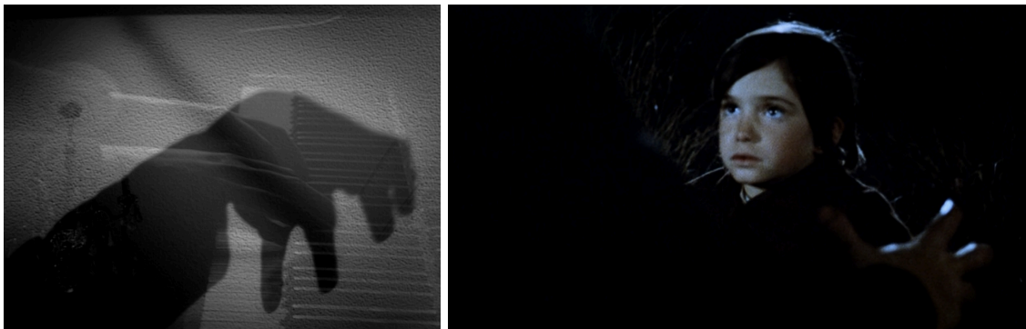
Figure 7. Transformation of the claw into the pianist's hand. La Morte Rouge . (Victor Erice, 2006). Nautilus Films.

new transposition from fiction to reality, from the scarlet claw to the pianist's hand: 'Playing dead was the only way death did wouldn't notice him, as if he were an already claimed victim, and so would pass by without stopping in search of other sleeping bodies. For weeks, the boy lived this nightmare to the full.' Superimposition now uses analogy to materialise the fusion between reality and fiction that occurs in the children's perception [Figure 7]. While Erice analyses here the importance of that claw in trauma, thirty years earlier the filmmaker used it symbolically in the fictional space. In The Spirit of the Beehive , the nightmare turns into a reverie in which Ana faces, trembling, the spirit. And, the menacing claw of the monster also appears in the lower right part of the frame [Figure 8]. Therefore, this fiction image is reinterpreted thanks to the essayistic reflection made possible by the diptych, turning the trauma between reality and fiction into their fraternity. The image of the claw approaching Ana thus stands as a symbolic sentence-image of the catharsis of trauma that fictional creation achieves.