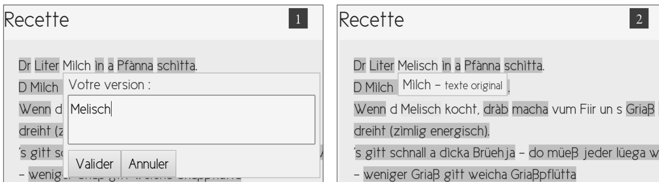
Figure 3: Spelling addition (1) and visualization (2) on a crowdsourced recipe in Alsatian (highlighted words present at least one additional variant).

replies. Both surveys were published in French, the Alsatian community (Huck et al., 2007) and 98% of the Mauritian population (Atchia-Emmerich, 2005) being bilingual with French.