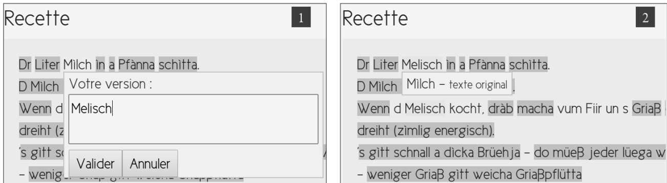
Figure 3: Spelling addition (1) and visualization (2) on a crowdsourced recipe in Alsatian (highlighted words present at least one additional variant).

replies. Both surveys were published in French, the Alsatian community (Huck et al., 2007) and 98% of the Mauritius population (Atchia-Emmerich, 2005) being bilingual with French.