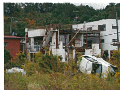
The town of Tomioka in the zone of limited residence, October 25, 2013. Radiation level at 3 µSv/h.

An expert at Fukushima University in charge of protection against catastrophes, interviewed in June 2014, spoke of the great resilience of the Japanese during earthquakes. His remarks