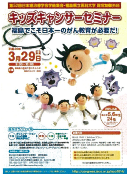
Upbeat publicity poster for a March 29, 2014 event at a Fukushima primary school 19 :