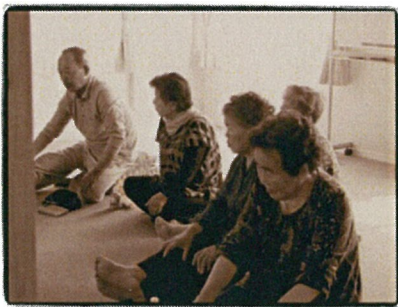
Temporary lodgings in Aizuwakamatsu, May 2013.

By “catastrophe”, I refer to what Jean-Jacques Delfour 3 has defined as “the normal effects of a series of real causes and the exposure of that series, that is, the negligence, minimizations, circumventions, and refusal to consider the risks created.” It is essential, when considering a government’s management of migratory flows and the choices it makes, to understand both the relevant domestic and international politics. Moreover, among the greatest paradoxes that have followed the catastrophe in question, is the multiplication of international agreements concerning nuclear energy between France and Japan (notably between Areva and Mitsubishi) for the construction of new nuclear plants and the operation of new uranium mines, 4 particularly in Asia. Additionally, though perhaps a coincidence, is the Mitsubishi Group’s first participation in Eurosatory, the world’s largest armament trade show, in June 2014. 5