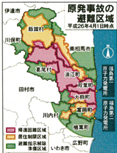
For 2014 Map (right): pink is the "difficult return zone" (more than 50 millisieverts/year), yellow is the limited residence area (20 to 50 msv/y), green is the "preparation for cancellation of the evacuation directive" area (below 20 msv/y). June 2014 11

were illustrated by a slide presenting a simple equation: a scale is shown with, on one side, a heavy circle representing resilience and, on the other, a light circle representing catastrophe. In this schema, the heavier the resilience, the lighter the effects of the catastrophe. When I asked what that meant to him in concrete terms, he answered uncomfortably that three days earlier a magnitude-4 earthquake had negated these concepts: "for us, now, it's about enlarging the roads, so that people can flee and the blockages of 2011 don't reoccur in the case of a new catastrophe, [which should be considered] since we are relocating them at the foot of a nuclear plant that is still unstable." The need to reduce the present, and growing, distance between science and conscience could not find a clearer example.