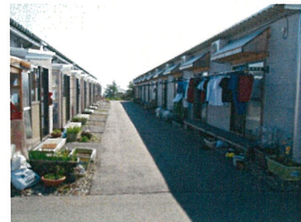
Temporary lodgings in Aizuwakamatsu, May 2013.

together representatives of countries all over the world, where they resolved to develop nuclear plants that would henceforth be secure and without danger. In the same year as the Fukushima triple disaster, the political decision was made to pursue and develop nuclear energy, placing a premium on the quickest possible return to normalcy at the least cost. The tools devised by the International Commission on Radiological Protection (ICRP) for radioprotection, based on “concepts of collective doses and on cost-benefit analyses” are used as a foundation for calculating profitability in situations of risk. For the ICRP, the management of risk is guided by an equation, which assigns an economic value to human life, and from which the cost of protecting that life may be calculated, thus determining the cost-effectiveness of providing that protection. 6 As Jacques Lochard, a member of the Main Commission of the ICRP and director of CEPN (Centre d’étude sur l’Évaluation de la Protection dans le domaine Nucléaire), stated during an interview with the author in November 2013, “Ethos is never without Thanatos”. 7 The key is to know on which side one wants to tip the scale. Assigning a monetary value to human life certainly provides an extreme example of the tendency in our society toward the objectification of human beings, one fully consistent with the present Abe Shinzo government’s attempts to reopen Japan’s closed nuclear facilities.