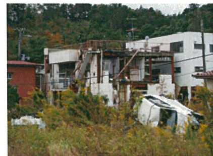
The town of Tomioka in the zone of limited residence, October 25, 2013. Radiation level at 3 µSv/h.

An expert at Fukushima University in charge of protection against catastrophes, interviewed in June 2014, spoke of the great resilience of the Japanese during earthquakes. His remarks