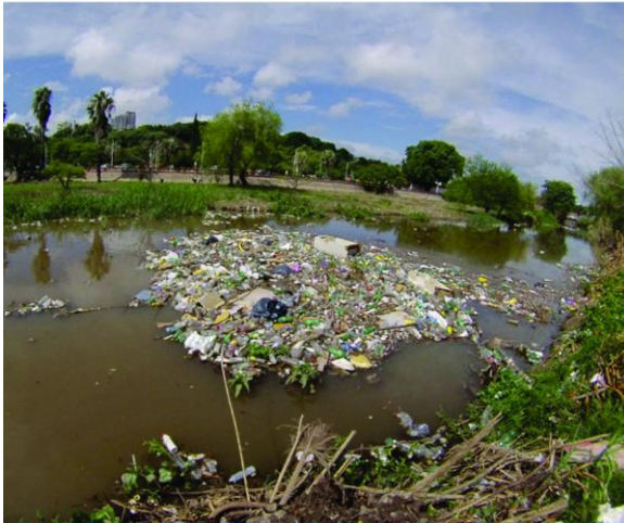
Freshwater birds are using garbage as nesting material