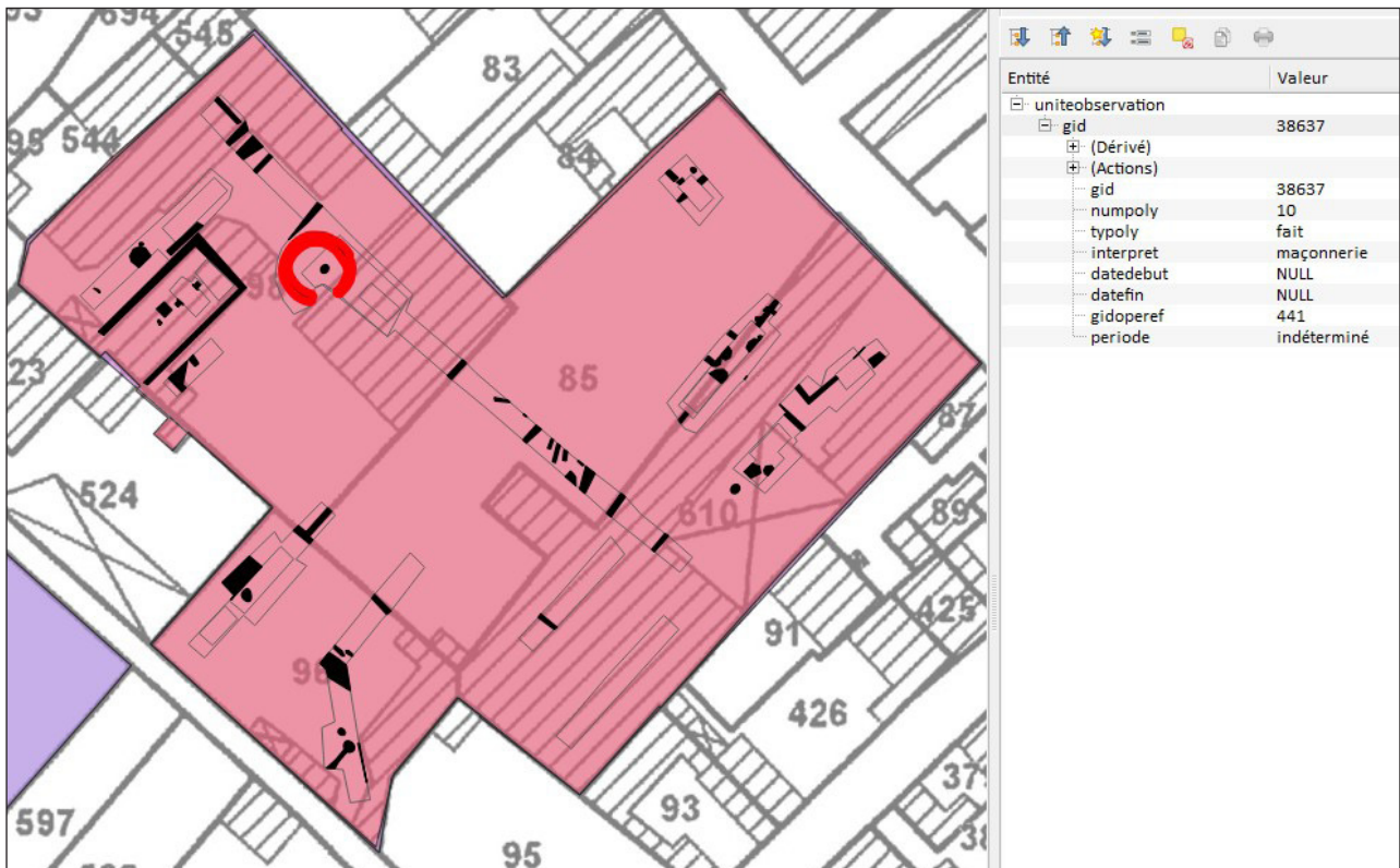
Figure 3: Spatial data is more than a place marker: much more spatial data was recorded by INRAP during the fieldwork, including both the project and trench extents as well as the locations of individual features.

The two examples presented here ( Figures 1–3 ) require the consistent application of data standards to combine