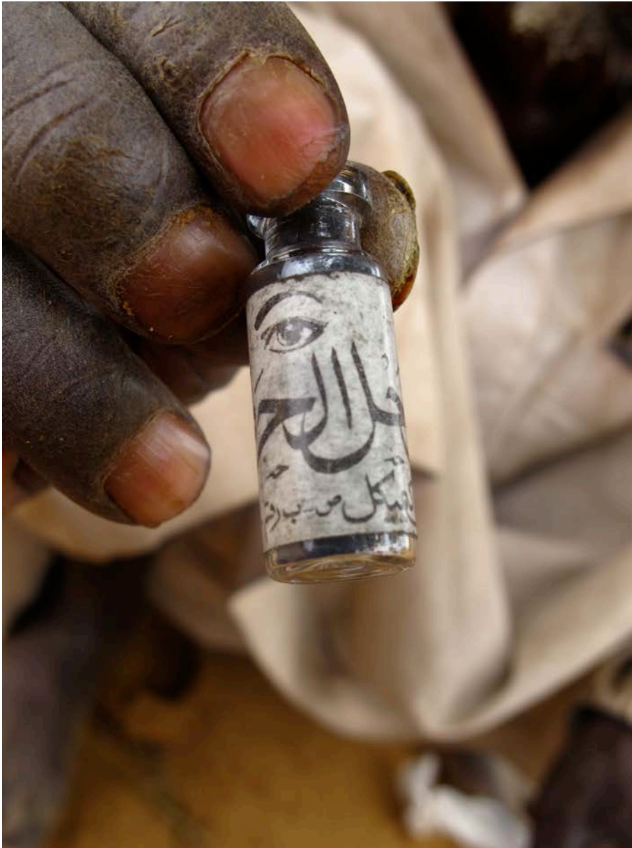
Image 5. Eyedrops used to treat trachoma.