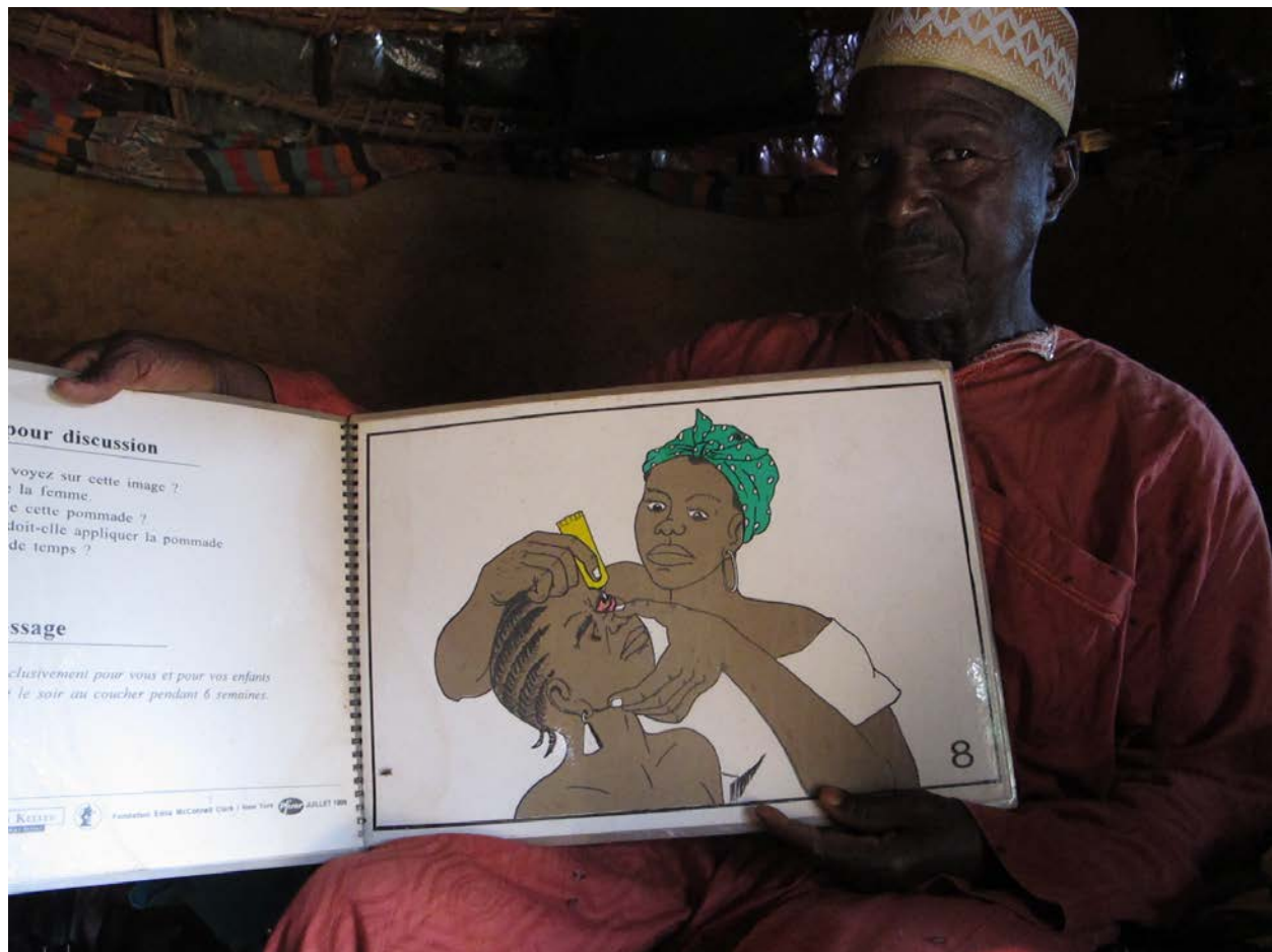
Image 1. Trachoma program health education message showing how tetracycline should be applied.

The Global Trachoma Elimination Program being implemented by the government of Niger works to create shared biomedical understandings of trachoma, its prevention, and its treatment, largely through the dissemination of images. These images are circulated by community volunteers trained to participate in the annual distribution of the oral antibiotic azithromycin (donated by Pfizer under the brand name Zithromax) and tetracycline ointment, and to provide health education messages that encourage the use of tetracycline ointment for the treatment of every active eye infection.