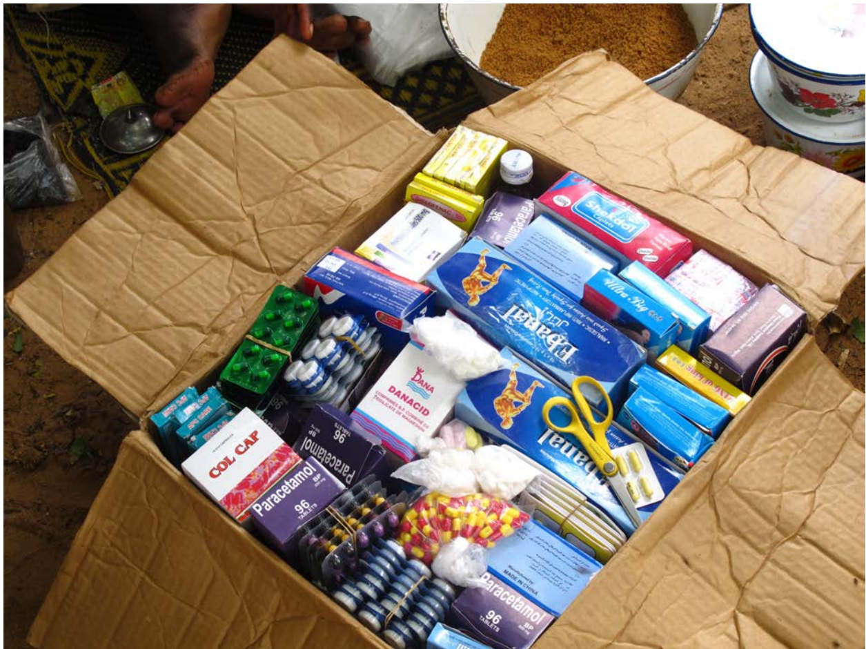
Image 4. Medications sold by an informal pharmacy on the village square.