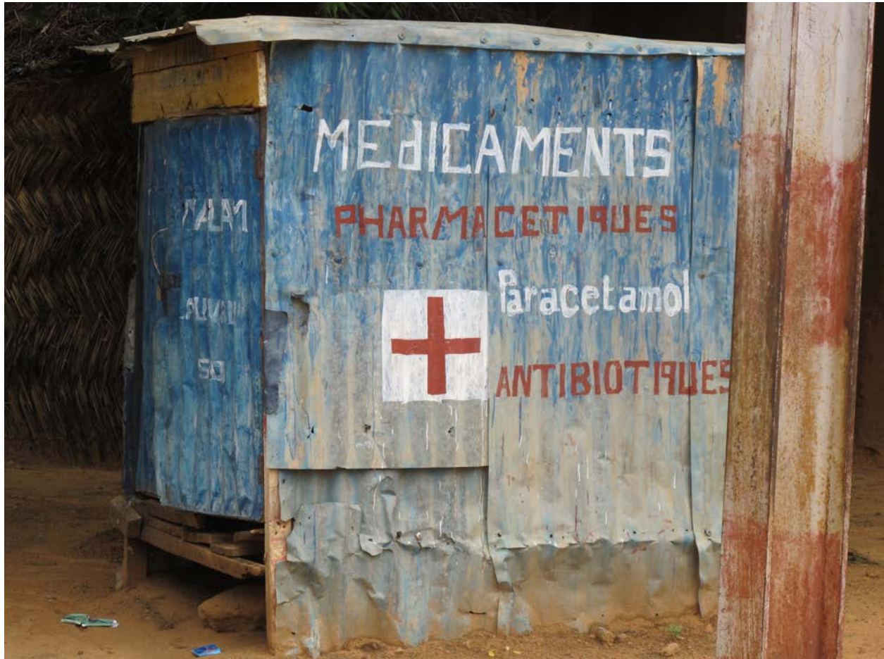
Image 3. Kiosk selling biomedical treatment.

‘There is a medicine for every sickness’, I was often told by my interlocutors. In Kawari, residents accessed multiple frameworks for understanding and addressing ill health, experimenting with different medications and medical systems until symptoms disappeared. These included Islamic and plant-based remedies, often used alongside biomedical treatments distributed by public health programs.