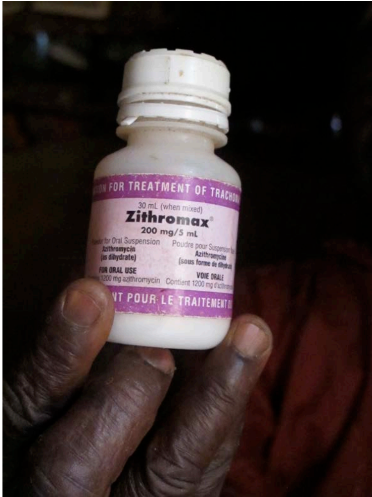
Image 10. Azithromycin used for mass distribution.

Global health projects being implemented in Niger, like many other places in sub-Saharan Africa, are often ‘one-size-fits-all’ strategies, developed in Geneva or other transnational health hubs, and then implemented with only minor modifications in very diverse local contexts. The material objects associated with these projects – not only pills and ointments, but also posters, T-shirts, and medical flip charts – reflect clearly delimited, biomedical understandings of disease. But as these technologies and images circulate in places like Kawari, they take on a life of their own, and are oftentimes integrated with other kinds of understandings of illness and practices of care. To return to the quote that opened this essay, to understand a sickness like trachoma through the lens of biomedicine alone means ignoring the multiple and dynamic ways in which illnesses and their treatments are engaged with by the individuals who manage them.