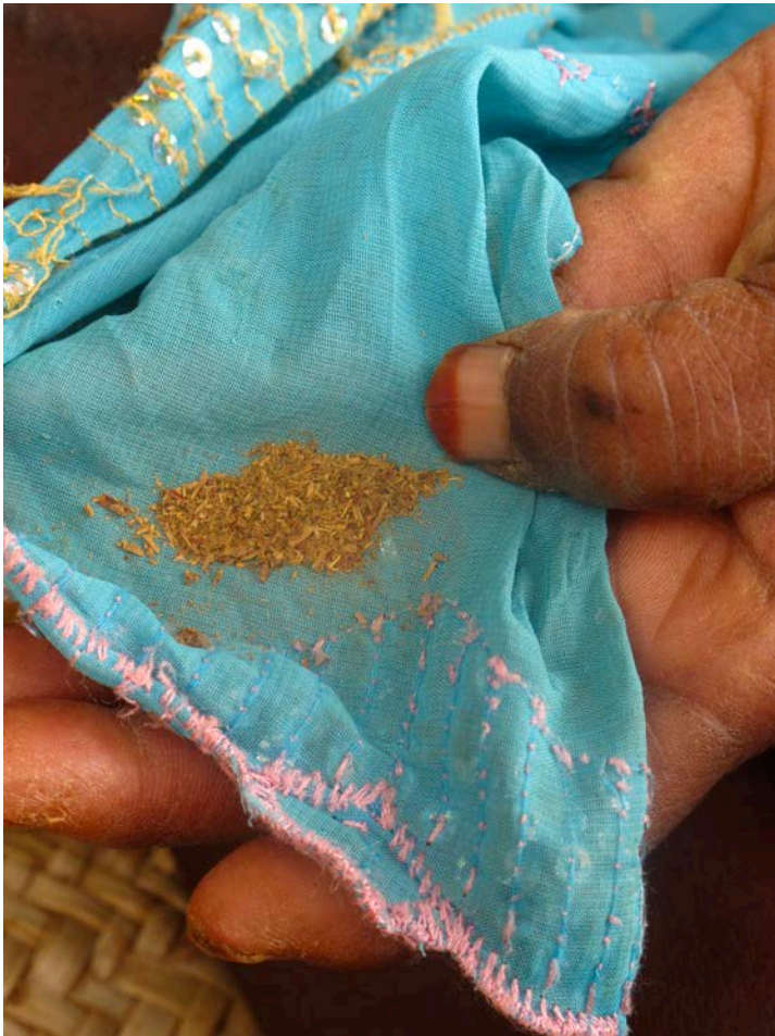
Image 6. Locally made herbal medicine for eye disease.