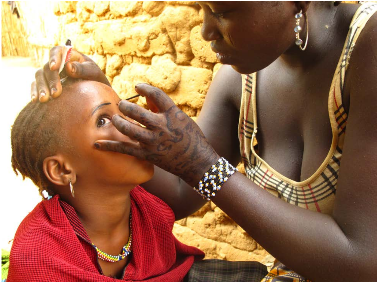
Image 9. Kohl being applied for beauty and eye health.