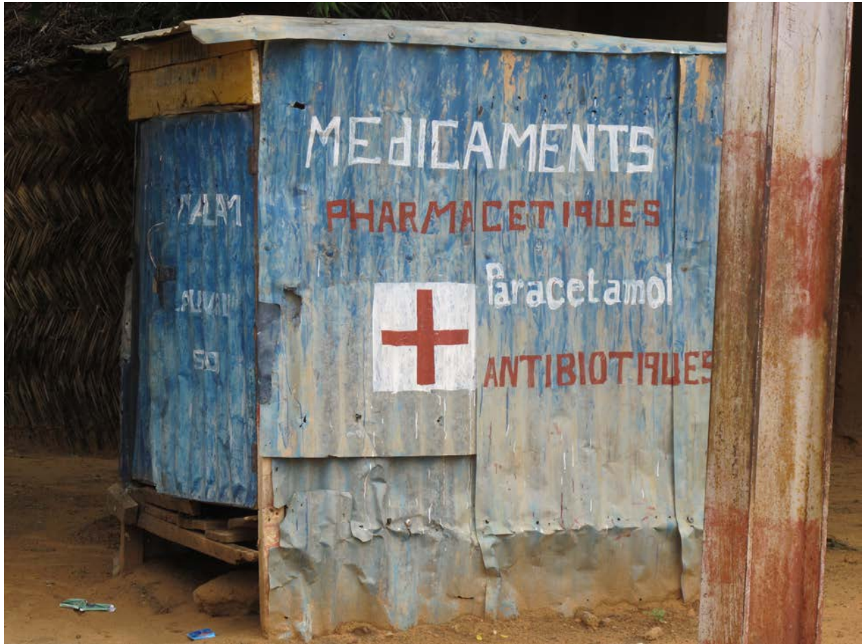
Image 3. Kiosk selling biomedical treatment.

‘There is a medicine for every sickness’, I was often told by my interlocutors. In Kawari, residents accessed multiple frameworks for understanding and addressing ill health, experimenting with different medications and medical systems until symptoms disappeared. These included Islamic and plant-based remedies, often used alongside biomedical treatments distributed by public health programs.