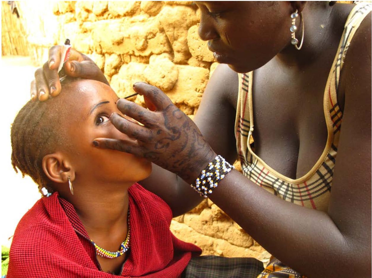
Image 9. Kohl being applied for beauty and eye health.