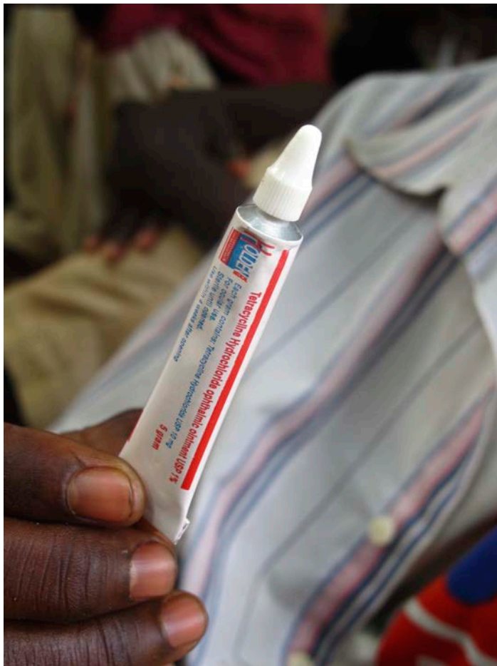
Image 2. Tetracycline ointment at the informal pharmacy.

Although the elimination campaign increased biomedical understandings of eye disease – for example, the notion that trachoma is caused by a lack of sanitation and hygiene – people did not generally draw on these kinds of biomedical understandings to explain the eye problems they experienced, attributing them more often to foreign objects in the eyes or a symptom of teething in babies. And yet, medications promoted by the elimination campaign, such as tetracycline ointment, were used to treat a variety of eye problems in the village. In many moments, these medical technologies circulated independently of biomedical understandings of disease. In other moments, biomedical and nonbiomedical understandings of eye disease collided and combined to create novel configurations of prevention and care.