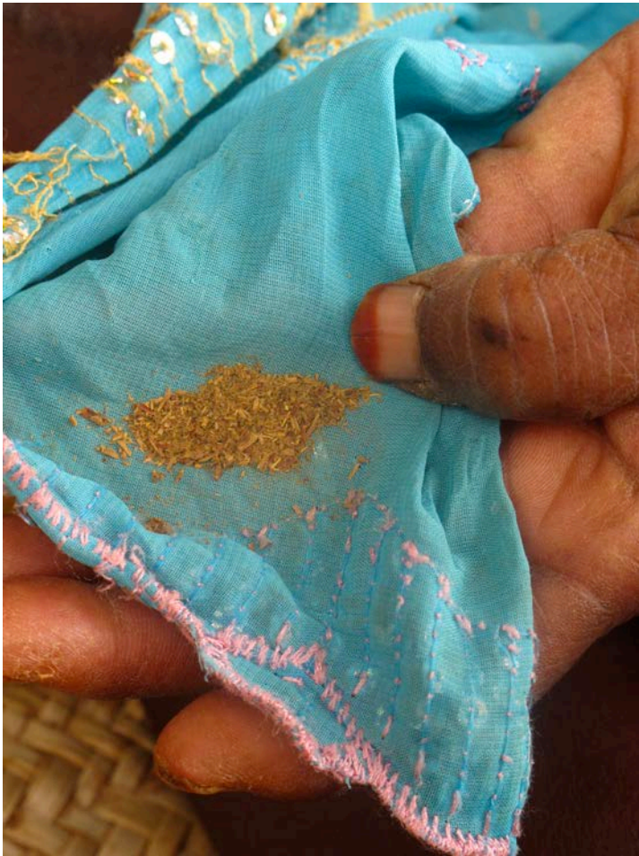
Image 6. Locally made herbal medicine for eye disease.