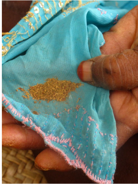
Figure 2 Pounded dried plants used to treat eye infection