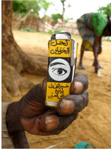
Figure 4 Eye drops bought from a nearby market for treating conjunctivitis

While kohl is historically tied to Islam, other eye medications used in the village seemed to be more loosely connected, many, like these eye drops, appearing to be reinterpretations of biomedical treatments positioned within religious frameworks during their circulation. Medications labelled in Arabic connected their Nigerien consumers with a broader imaginary of the Muslim world and the birthplace of the religion. Interlocutors explained that the value of these medications came not only through their physiological properties, but also through the larger healing power represented by Islam. Unlike other medications, these treatments were grouped together with other religious objects when sold in the market and by local vendors.