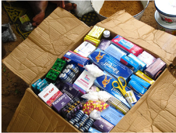
Figure 1 Medications for sale at a village table

When an individual bought medicine from a village table, he engaged with a participative system that encourages active negotiation about the type and quantity of medication to be purchased. This ‘easy entry’ into the margins of biomedical treatment did not require the same notions of identity as obtaining medication from the health centre, and drew upon social relationships in the village. The client’s agency in making decisions about medication was not encouraged at the health centre that often handed patients written prescriptions with no discussion or explanation. Concerns about medication quality were mitigated by the autonomy and social relationships offered by informal pharmacies. The symbolic efficacy of these treatments was viewed by clients as contained not only within the medications themselves, but also in how they were delivered.