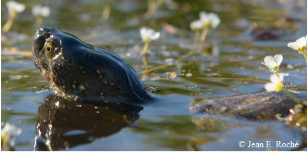
138x68mm (96 x 96 DPI)