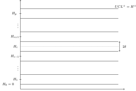
Figure 2: Three regions and operation rules of the Upward VSI CUSUM-RZ charts

we can assume that z_0 = 1 . We will use a Markov chain approach to calculate the ATS . Firstly, the control interval is partitioned p sub-intervals of width 2\delta where \delta = \frac{UCL^+}{2p} ( \delta = \frac{LCL^-}{2p} ) corresponding to p + 2 states of the Markov chain as demonstrated in Figure 2. In this Figure, the first line corresponds to the state 0; each other sub-intervals, say (H_j - \delta, H_j + \delta] , represents the in-control transient state j of Markov chain, j = 1, \dots, p while the state p + 2 is out-of-control or absorbing state one corresponds to a signal from control chart. If the statistic S_i^+(S_i^-) drops into the sub-interval j , the Markov chain is in the transient state j for sample i ; if not, the chain reaches absorbing state. The number of sub-intervals p is chosen sufficiently large (say p = 200 in this paper) so that each H_j , j = 1, \dots, p can be considered as the midpoint of the j^{th} sub-interval. This also makes sure that the method is effective, allowing the time to signal properties ( ATS ) to be accurately evaluated. The transition probability matrix \mathbf{P} of the discrete Markov chain is