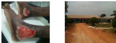
Figure 2. On the left an image demonstrating the increased severity of BU disease in HIV coinfecting patients. On the right the BU pavilion in Akonolinga, Cameroon.