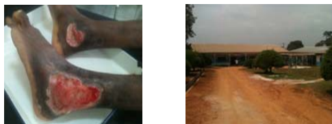
Figure 2. On the left an image demonstrating the increased severity of BU disease in HIV coinfecting patients. On the right the BU pavilion in Akonolinga, Cameroon.