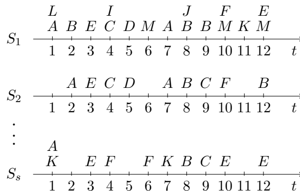
FIGURE 1. Example of sequence database.

at any time. Furthermore, due to identification of the consequent via the gap constraint, many candidate occurrences of the rules that do not respect this constraint are filtered out. Consequently, the running time of the algorithm is significantly reduced. Besides, we choose to mine rules with a consequent that contains only one event, which is common in the rule mining task [4]. As we will see, D-SR can be easily extended to mine rules with a consequent made up of several events. In addition, an additional originality of our algorithms is that, as they coexist with traditional algorithms, they make any mined rule more actionable and more intelligible to domain experts. Actually, while monitoring the event sequence during a prediction task, once the antecedent of a mined distant rule appears, the prediction of a distant event (the consequent) is triggered and estimated within at least gap timestamps. This allows domain experts to have potentially enough time to react depending on the nature of the future event.