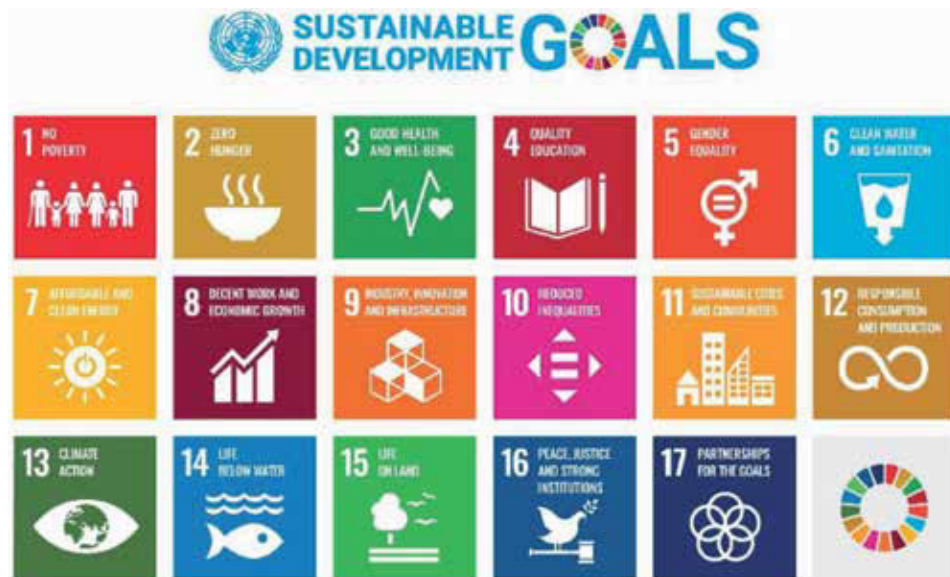
Figure 2. The 17 sustainable development goals [3].

The UN SDGs aim ambitions and necessary targets across a wide range of socio-economic, environmental, and governance issues in order to reduce the significant gaps between high-income countries and emerging economies in terms of population access to critical services (health, education, public utilities, infrastructure) and to limit the extreme poverty among the most vulnerable populations from Asia, Africa, Latin America, or Eastern Europe.