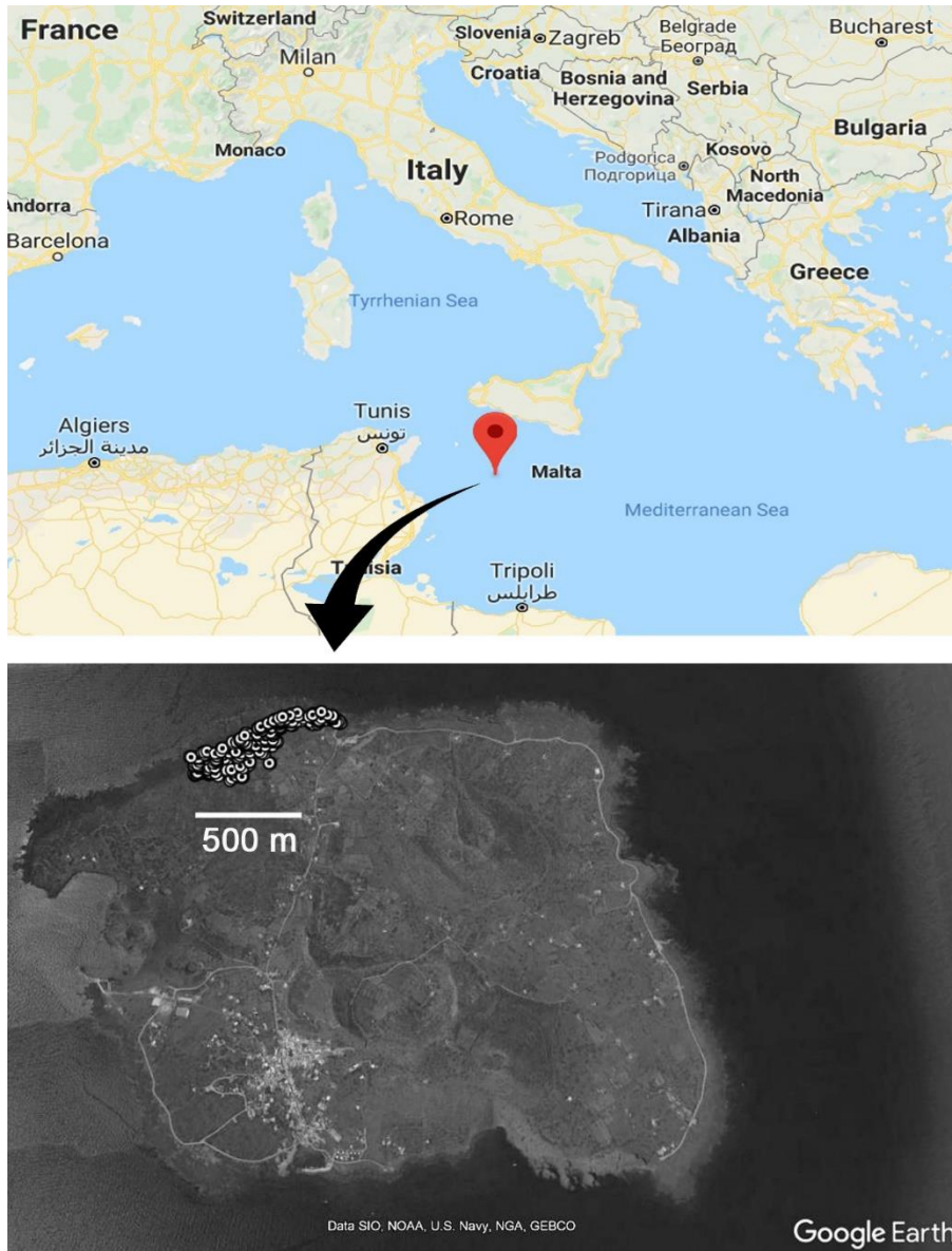
Figure 1. Distribution of nests on Linosa island. Birds breed inside crevices in the lava formation, and are mostly concentrated on the coast of Mannarazza, on the northern side of the island.