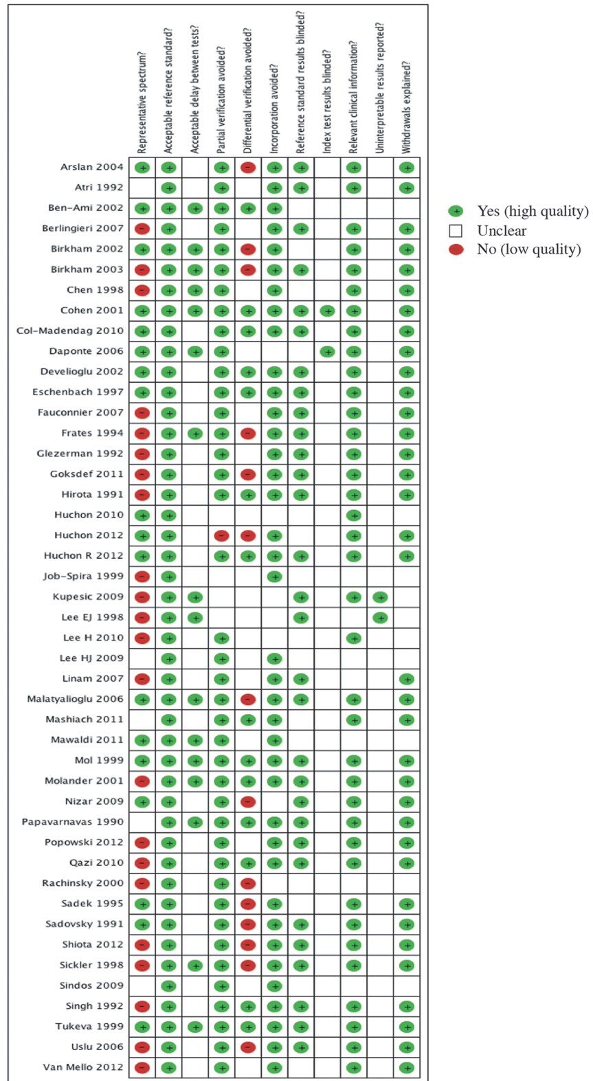
Fig 3. Methodological quality graph. Our judgements for each methodological quality item for all individual studies.