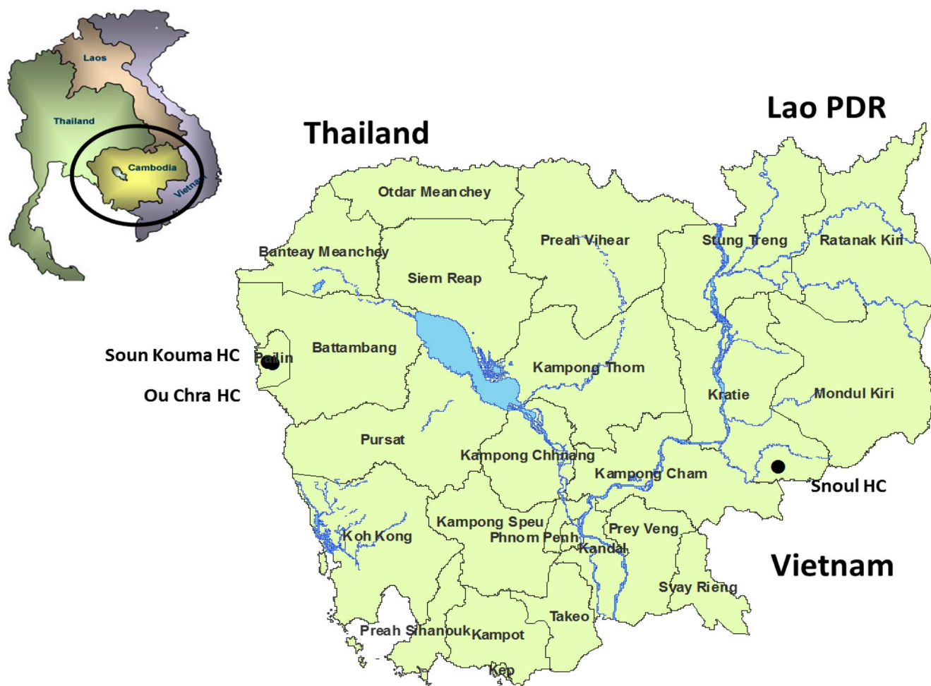
Figure 1. Map of Cambodia displaying the location of the study sites in remote areas in western (Soun Kouma and Ou Chra) and eastern Cambodia (Snuol).