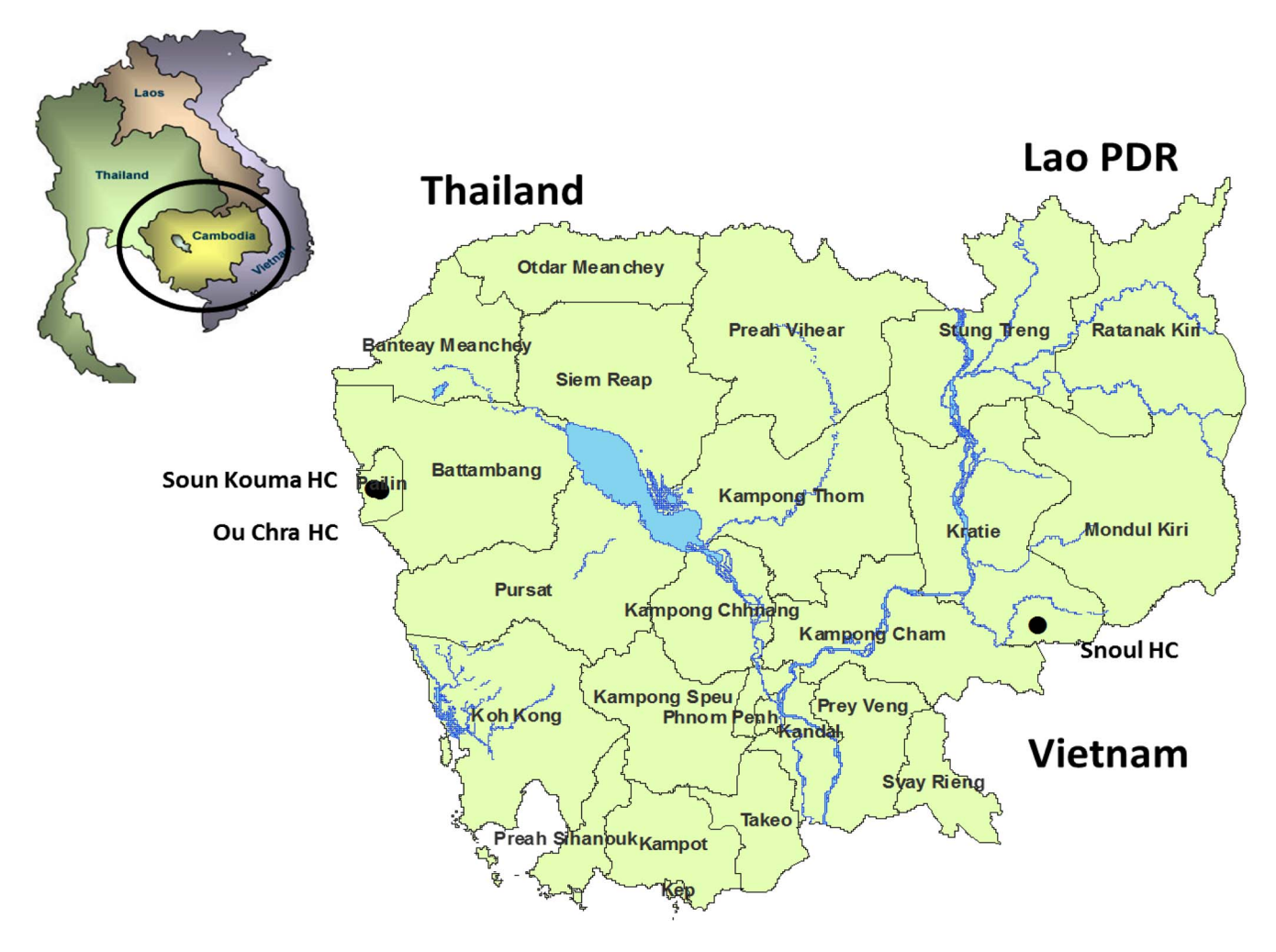
Figure 1. Map of Cambodia displaying the location of the study sites in remote areas in western (Soun Kouma and Ou Chra) and eastern Cambodia (Snoul).