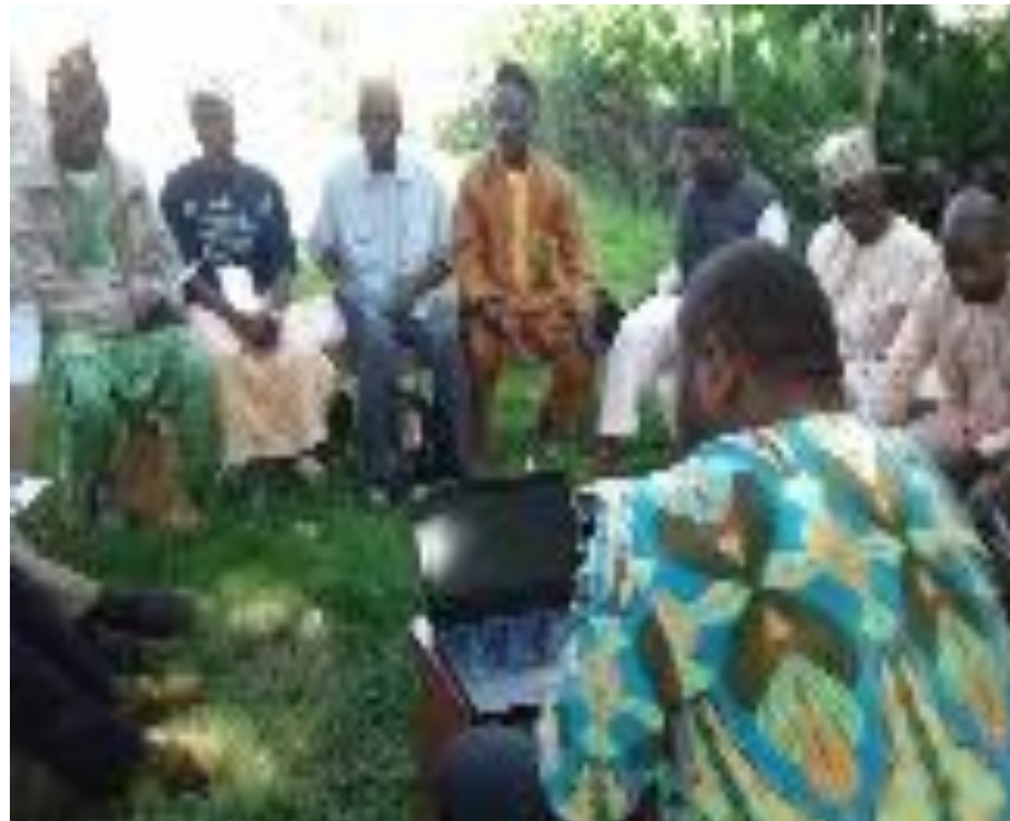
FGDs with traditionnal healers Bankim