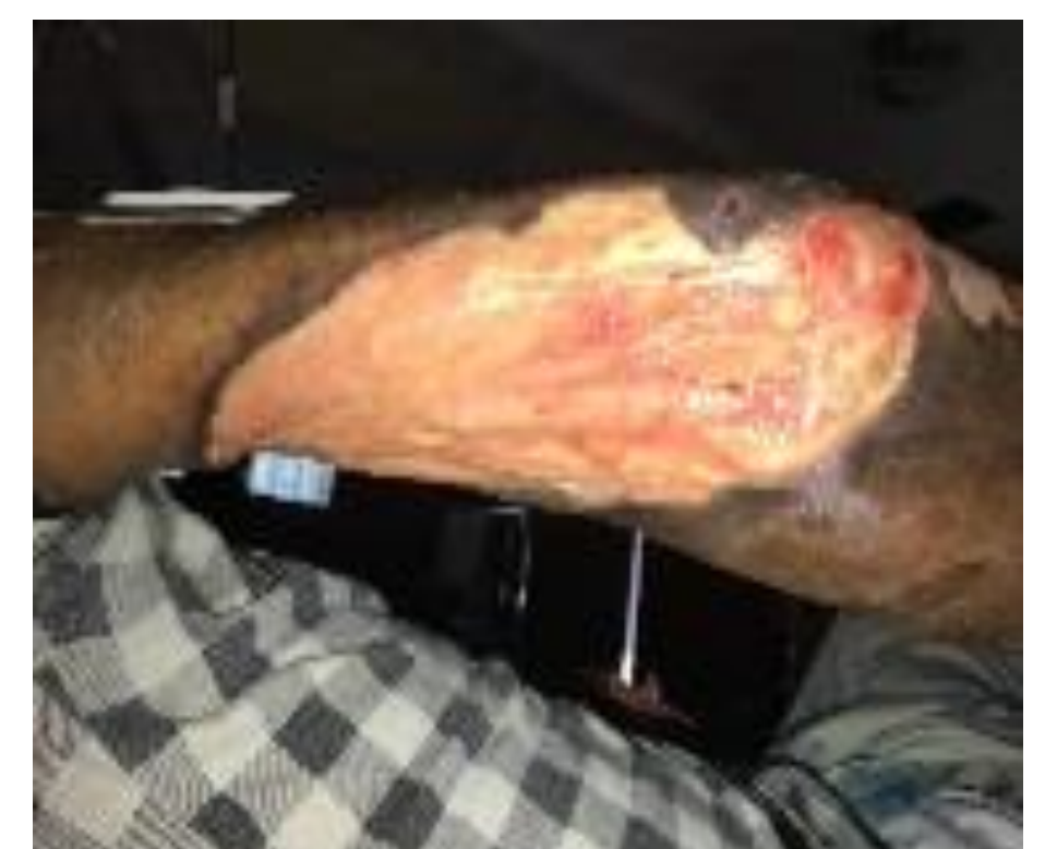
Patients sufferring from BU