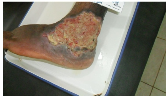
Figure 4 BU ulcer on lateral aspect left ankle showing significant reduction in swelling of skin and subcutaneous tissue of the forefoot with preservation of tissue following 30 days of prednisolone treatment.

[5,6]. This was later supported by the histological appearances that showed evidence of an intense inflammatory reaction consistent with previous descriptions of paradoxical reactions [6,9]. Paradoxical reactions, also known as immune reconstitution reactions, [9] are proposed to result from a reversal of the mycolactone toxin induced immune-inhibitory state via the antibiotic mediated killing of M. ulcerans organisms allowing an intense immunological reaction to develop against the persisting mycobacterial antigens [10,11]. As has been reported in HIV-negative patients following the completion of antibiotics, [12,13] a second paradoxical lesion developed on the retromalleolar region of the left ankle 6 months after antibiotics were ceased. Late reactions may account for up to 24% of paradoxical cases, [6] and this reaction was likely due to enhanced immune responses to a previously undetected disease focus.