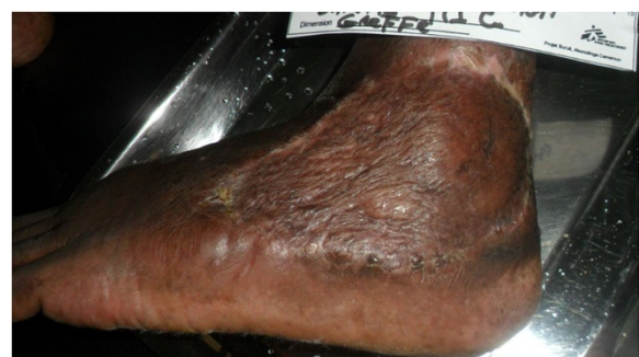
Figure 5 Healed BU lesion 10 months after commencement of antibiotics and 2 months post split skin graft.

It is not known whether paradoxical reactions are increased in HIV patients with BU, whether this is influenced by the baseline level of immune suppression or whether it is further potentiated when the generalised immune suppressed state is partially reversed by ART. However it is known that paradoxical reactions are common in HIV patients commencing ART with a variety of