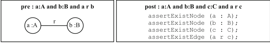
Fig. 2. Source graph and test cases generated from the running example

post-condition represents the existence of a node or an edge in the target graph. Thus, from the given pre-condition we can generate a source graph and, from the given post-condition, generate a set of test cases for the required properties. In our framework, dynamic analysis consists in testing the target graph obtained by the transformation with the generated test cases which are expressed in JUnit. In this context, we defined and implemented a unit testing library for small-t ACC having about twenty assertion methods allowing testing the existence and multiplicity of nodes and edges.