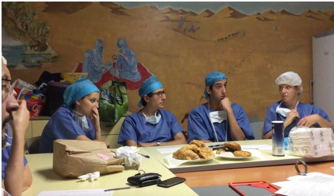
Figure.3: Practitioners during the debriefing session

An example of a practitioner questioning his actions occurred when one of the surgeons witnessed himself on the video recording being verbally aggressive to the assistant surgeon: