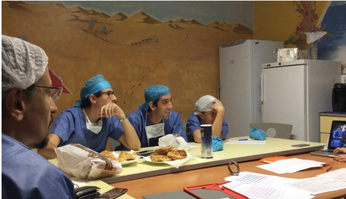
Figure.4: Practitioners confronted with video recordings of their surgical acts in the OR.

Being confronted with their actions opened a new discussion on the nature and content of the interactions among the practitioners. The change of the way of communicating and the limited interaction between the practitioners when robotics was introduced were the main issues that the surgeon was interested to discuss.