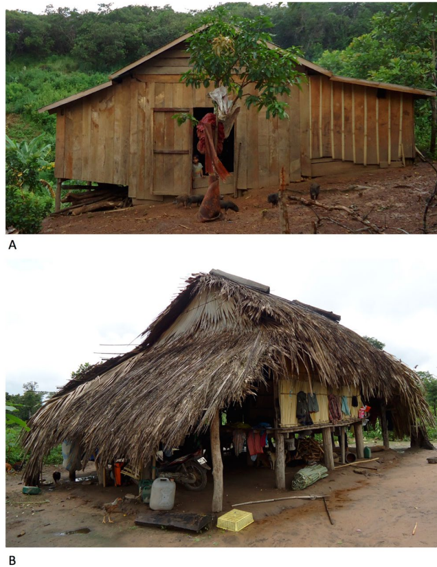
Figure 2. Example of different housing styles in the study villages. Panel A: Ground-level house constructed of wood walls and floor, and tin roof. Panel B: Elevated house constructed of bamboo walls and floor, and plant-based (palm frond) roof.

covariates. However for cluster-level effects, the interpretation is the change in odds of the outcome at each level of the exposure variable relative to the baseline category within the same cluster (and conditioned on covariates), which is problematic because cluster-level values are constant for all individuals within a cluster 46 . To address the difficulty in interpreting household-specific fixed effects, the approximate marginal (i.e. population average) effects were estimated by calculating and applying a shrinkage factor (equation 2 in 46 ) to the household-level log-odds ratios and presented as supplementary to the main results.