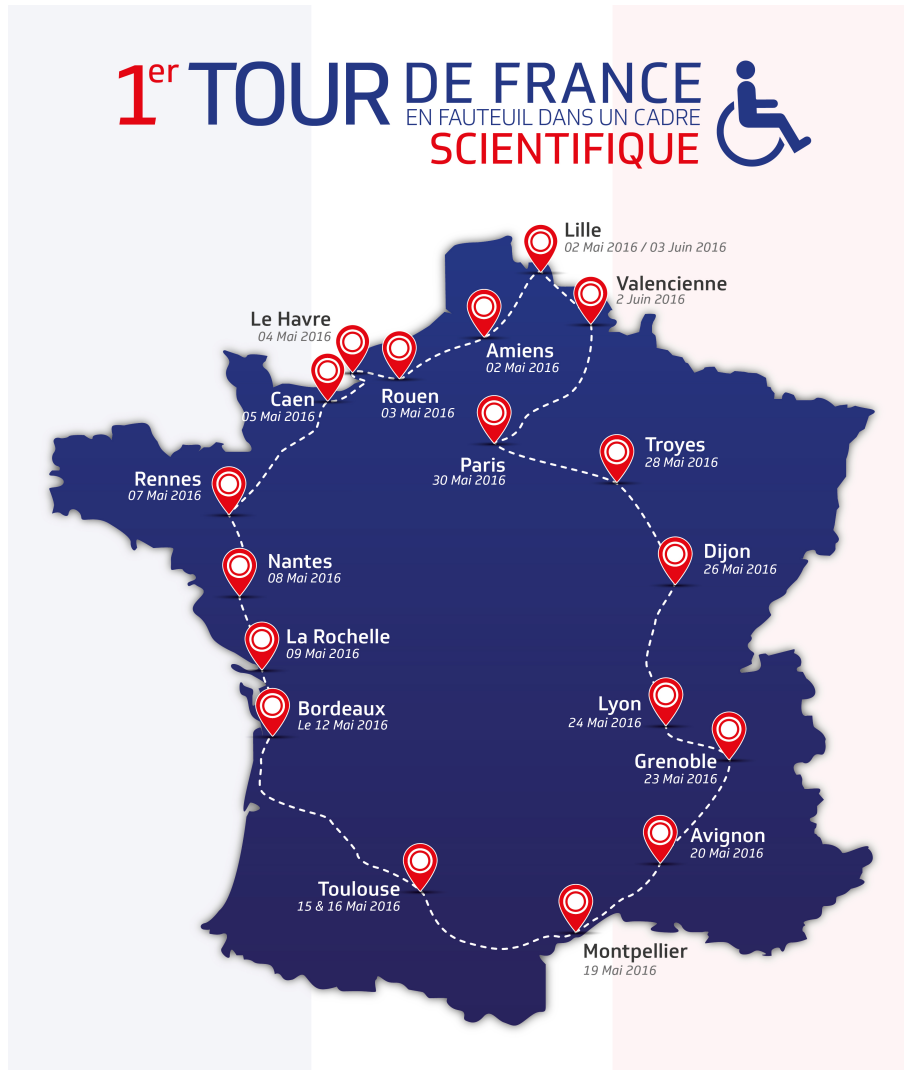
Figure 1: Route of the scientific “Tour de France” [4]

eral scenarios. Figure 1 details the route of the measurement sites (33 days and 3006 km).