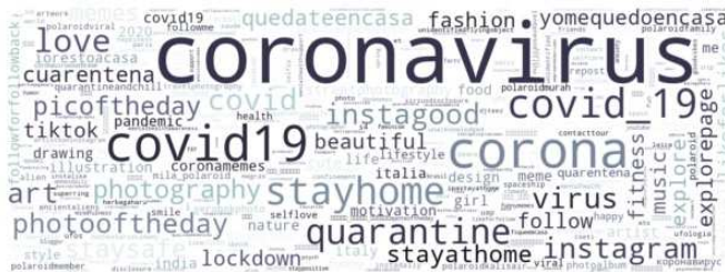
Fig. 1: Wordcloud of the most related hashtags in our dataset.

Hashtags. Recall that we gather the data by querying certain hashtags. Figure 2 presents the top hashtags tagged within the posts. Figure 1 also presents a wordcloud of the hashtags in our dataset. This naturally includes hashtags outside of our seed set used for crawling. There are intuitive examples, such as corona , covid19 , covid_19 , stayathome , quarantine , love , covid , virus , and instagram . The are therefore the most repeated hashtags that appear with #coronavirus. Note that this means will might miss posts that mention these concepts in other languages.