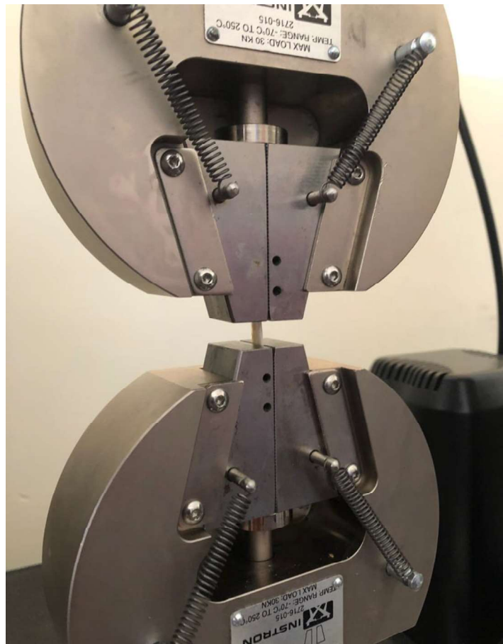
Figure 1 Tensile testing machine