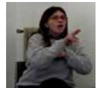
Highly Iconic Structure The child looks anxiously outside, from the windowsill