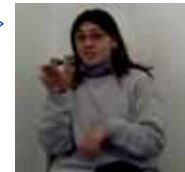
Word-like sign The child

Previous descriptions of SL and former comparisons of SL and VL are questioned. Research strongly suggest that substantial theoretical-methodological changes in general linguistics are required to account for SL structures, and for the effects engendered by the gestural vs. the vocal modality in shaping the distinctive properties of face-to-face human language (Russo Cardona & Volterra, 2007; Pizzuto, Pietrandrea & Simone, 2007; Cuxac & Antinoro Pizzuto, in press)