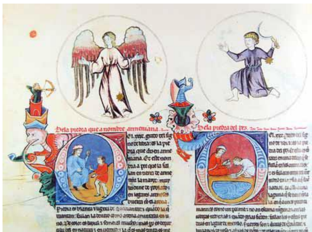
Fig. 6: Lapidario , Virgo and Engonasín, El Escorial, RBME, Ms. h-I-15, f. 56v.

that was passed on to the Latin West via the series of manuscripts known as the Sufi Latinus . 41 Several scholars, however, have disputed the legitimacy of the inscription and, therefore, the early dating of Marsh. 144. They argue that it belongs stylistically to a much later period, perhaps as late as the end of the 12th century AD. 42 There is, however, a variant tradition for the depiction of Virgo that appears in what is now considered by many to be the oldest surviving manuscripts of al-Sūfi's stellar tables: Ms. 2.1998, 1125 in the Museum of Islamic Art in Doha, which was made in Baghdād and is dated 519 AH (or April 1125 AD). 43 In the Doha manuscript, Virgo retains her