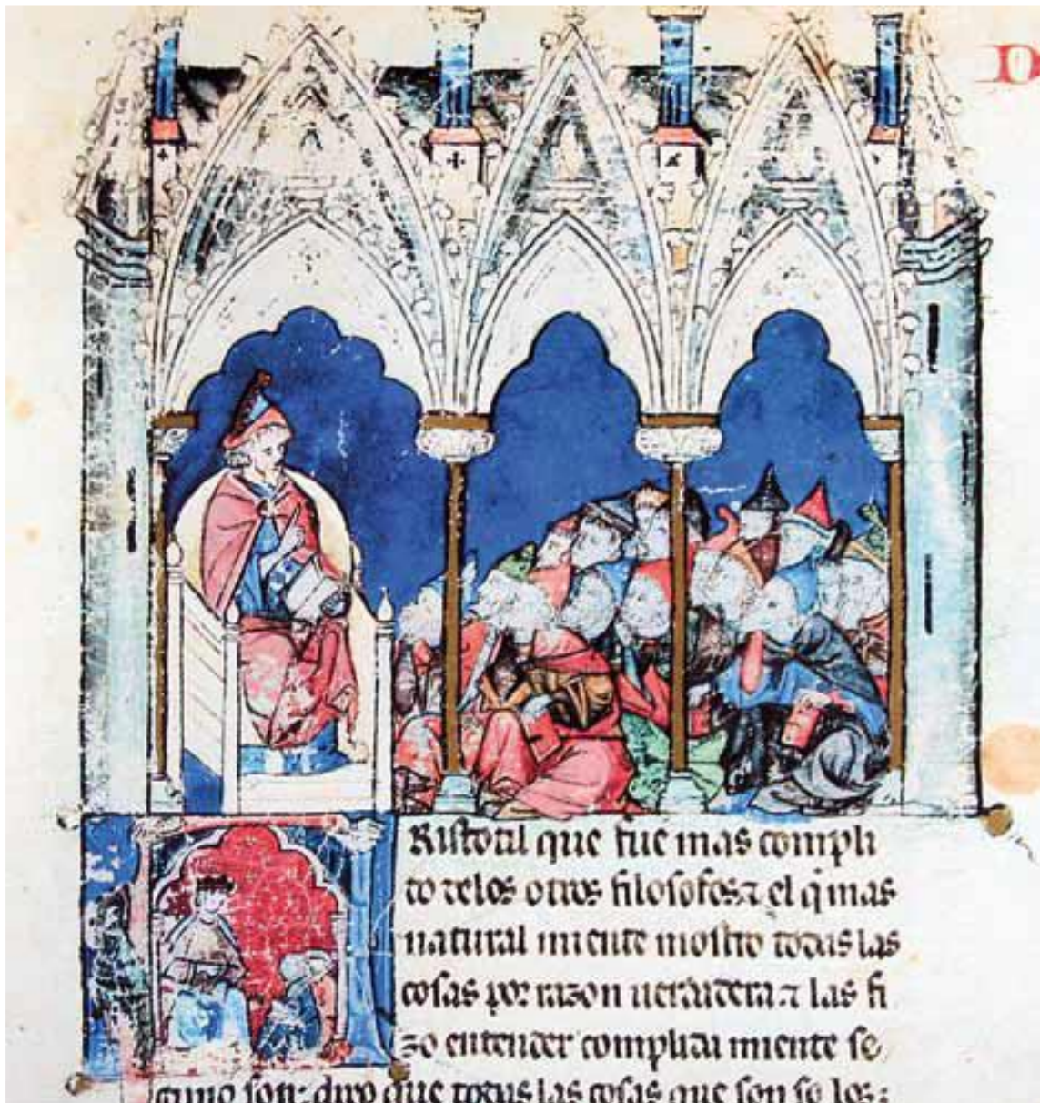
Fig. 3: Lapidario, opening image with Aristotle teaching his students and an historiated initial with Alfonso X and his collaborators, El Escorial, RBME, Ms. h-I-15, f. 1r.

understanding of the figures in the sky, for that reason we (the Alfonsine team) talk first of them.' 25