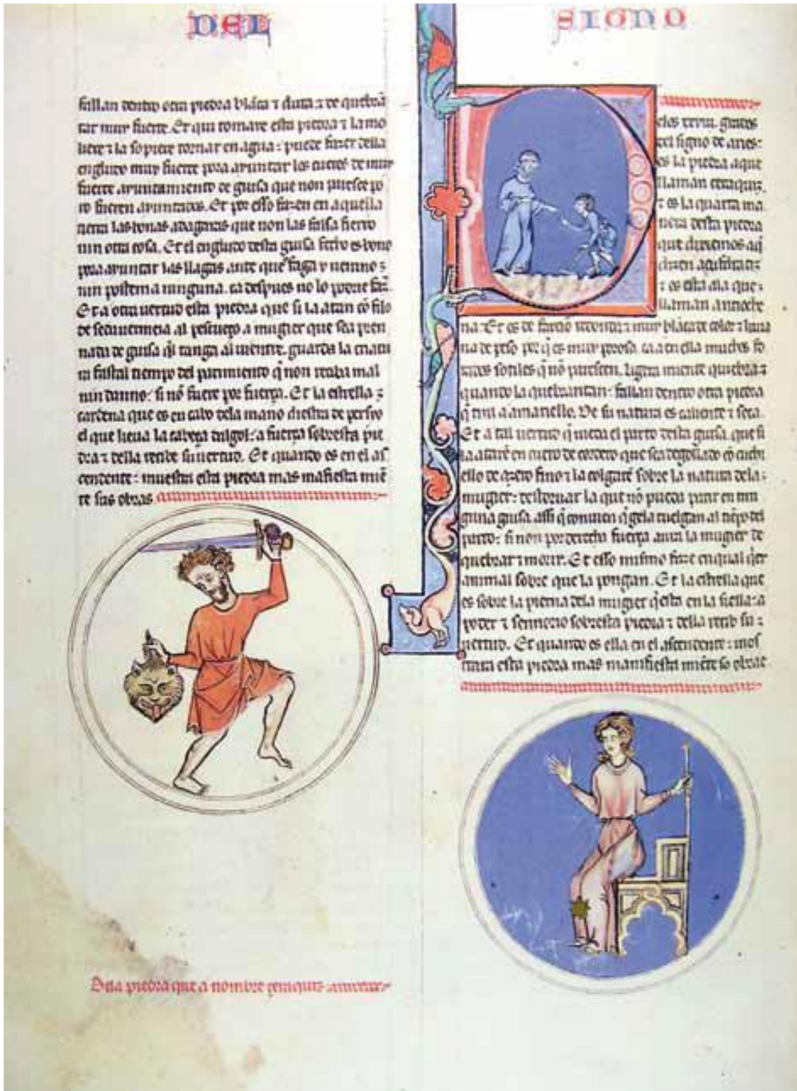
Fig. 5: Lapidario , Perseo and Casiopea, El Escorial, RBME, Ms. h-I-15, f. 9v.