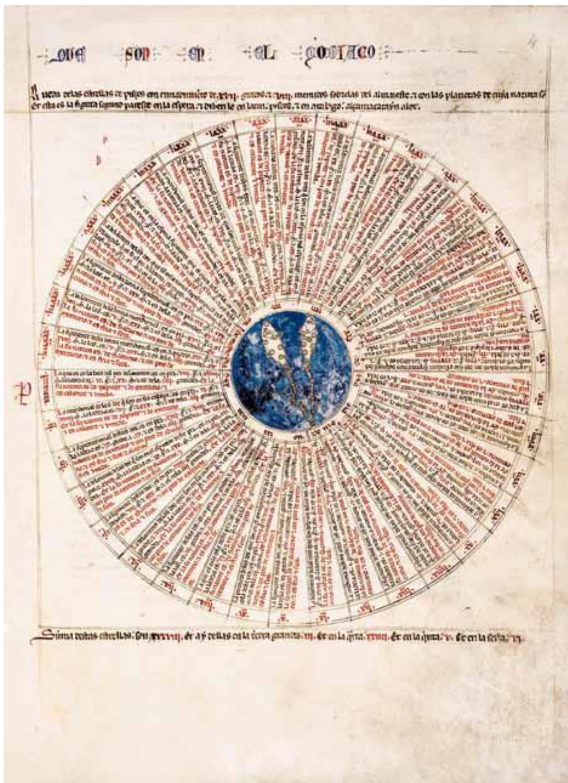
Fig. 2: Libro del saber de astrología , 'Rueda de las estrellas de pisces', Madrid, BH UCM, Ms. 156, f. 4r.