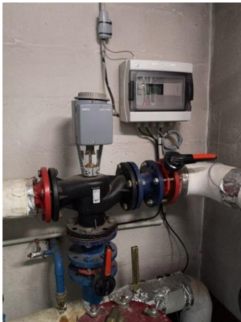
Figure 1: Installation example of a thermal energy meter for heating energy demand monitoring

delayed to this second phase). Power demand is assessed with sensors installed on the main electric meter and switchboard, and smart-plugs to monitor all the main appliances of the instrumented apartments (one-minute time-step). Apartment-scale hot water consumption is assessed using contact-temperature sensors on hot water pipes (one-minute time-step) completed with data from already-installed remote reading volumetric meters. Also, heating energy consumption is deduced in a similar way using contact-temperature sensors on heaters (hourly time-step). Natural gas consumption, only used for cooking, is monitored with sensors installed on apartments gas meter (one-minute time-step). Indoor conditions and comfort should be captured using contact-temperature sensors positioned on exterior walls of the apartments and a sensor combining indoor temperature, humidity, luminosity, CO 2 and presence measurements (hourly time-step). Finally, occupants' behaviours should mainly be characterized through occupation data and using sensors for window opening-closing detection. This second deployment phase will start in November 2019.