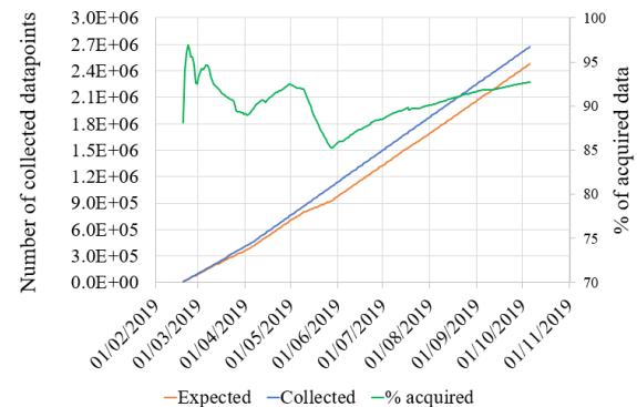
Figure 2: Evolution of collected datapoints (orange) compared to expected collected datapoints (blue) from 2019/02/19 to 2019/10/06

The main highlighted issue relates to missing datapoints. Over the given observation period, 92.7% of the expected datapoints are collected. Figure 2 compares the evolution of expected measurements (blue curve) and of the effective collection results (orange curve) with the variation of the percentage of acquired data (green curve). The major gap is due to a 17-day-long sensor malfunction in May 2019 for the electrical switchboard monitoring. Electricity demand data collection is therefore the category with the least collected datapoints (on Figure 3: 92.0% of the optimal target), followed by thermal energy monitoring (94% of data collected). Indoor environment and passage counting account for more than 99% of collected data. However, large amounts of missing energy measurements should also be transposed to time-scale analysis. Indeed, electric sensors provide one-minute time-step information. Hence, over a 230-day observation period, it would be equivalent a loss of less than 19 days of data and in the present case essentially concentrated on a specific period for one specific sensor.