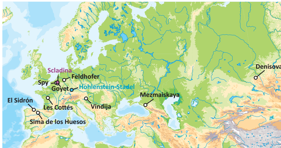
Fig. 1. Sites from which partial to complete nuclear genomes from Neandertals (or their ancestors in Sima de los Huesos) were retrieved. References (1, 6, 8, 20, 34–36) describe Neanderthal genomic data from these sites. The origins of the two Neandertals studied here are highlighted in purple and blue, respectively.