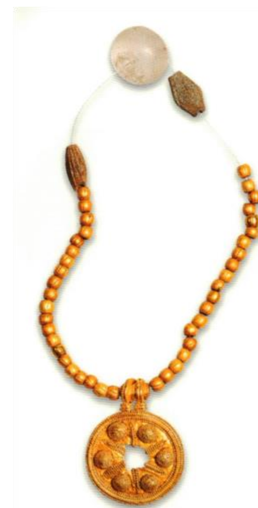
Gold pendant in the feminine grave at Toumba

In the Toumba cemetery, the two graves located under the protogeometric building are famous for the antiques they contained: a cypriot bronze amphora (LHIIIB/C) used as a cinerary urn for a male cremation and a near-eastern gold pendant (18 th century B.C.) was inserted into a necklace wherein two beads are in faience and one in rock crystal, dated back to the Mycenaean period. The structure was later covered with a tumulus , used as a landscape marker, and an elite cemetery was implemented in direct proximity. The graves there also provide us with antiques: two glass paste seals in grave 12B (PGA-PGM); a near-eastern gold pendant (LB) in grave 63 (PG) that can be compared to the one described earlier; a bronze arrowhead (LHIII) and a north-Syrian haematite cylinder seal (1850-1750 B.C.) in grave 79 (Sub PG II); as well as a bronze dagger (SM) in pyre 13 (SPG I-II). Other memory phenomena can be added to this, like the consciously re-used tumulus as well as possible ritual activities honouring the dead, suggested by the ceramics found in the cemetery (POPHAM et al. 1980; 1982).