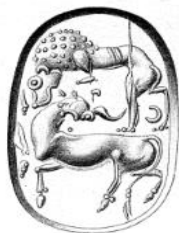
Lapis lazuli seal (Xeropolis) Source: PINI 1975, p. 325, n°424.

It is important to use a neutral terminology that matches the reality of archaeological research. I chose not to use concepts that are too highly connotated, such as objects of memory or relics . For some time, I used the Homeric keimèlia (CAMBERLEIN 2016), but it describes mainly objects of value integrated in a system of gift exchange, which is very difficult to prove in an archaeological context. The word heirloom , used at first in ethnological studies, represents “anything inherited from a line of ancestors, or handed down from generation to generation”. In an archaeological context, however, it is impossible to claim that the passing down of an object occurred within the family context. “Heirloom” should therefore only be used to define certain artefacts found in very specific contexts and curated over a period of 100 years or less. I will therefore use the word antiques, which is a more generic and neutral term and does not leave out any kind of context of discovery, typology, preservation method, function or how the object was passed down.