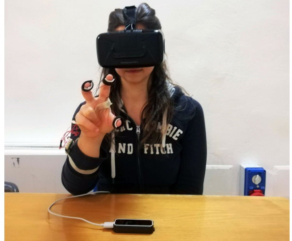
Fig. 1: Haptic hand guidance using vibrations in a demonstrative Virtual Reality scenario. The user wears the haptic thimbles and orients the hand following the cues displayed at the user’s finger pulps. The fingertips and the palm positions are tracked by a Leap Motion device placed on the table.

operators desiring to know in advance the best way to approach a tool.