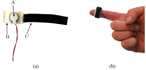
Fig. 3: The vibrotactile cutaneous thimble. A vibrotactile motor (A) is enclosed on a 3D printed thimble (B). A Velcro ® belt (C) enables the user to easily fasten the device on the finger. The total weight of the thimble is 3.02 g.

To suggest the hand orientation, we provide vibrotactile stimuli via haptic thimbles. The system consists of four thimbles, an Arduino Pro-mini 3.3V, a 3.7V Li-Po battery, and a RN-42 Bluetooth antenna. Each thimble is made by ABS and contains a small coin-factor eccentric mass motor (Precision Microdrives Model 310-103 [23]). The electronic components and the battery are embedded into a 3D printed case. The Bluetooth baudrate for the communication is 115200 bps. Motors are controlled using the PWN output pins, where the maximum voltage (3.3 V) corresponds to a PWM value of 255, whereas the minimum of 0.9 V corresponds to 70. In Figure 3 a thimble and an user wearing it are depicted.