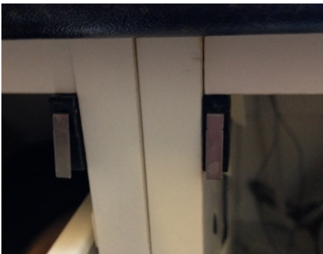
Fig. 2: Miniature snap-action switches installed in a cupboard and a drawer.

Avoiding complexity was also important, since keeping the system simple reduces the opportunities for failures. For this reason, switches were chosen for their mechanical simplicity, and their production of binary data which is easier to process and transmit. These switches would need to be reliable and durable. Considering all of these requirements, miniature snap-action switches [13] are an optimal choice due to their low cost, mechanical stability and reliable activation at specific and repeatable positions. These were positioned flush with the frame of each cupboard (see Figure 2) to maximise the force acting on them from the cupboard doors. The same system was also successfully used for drawers.