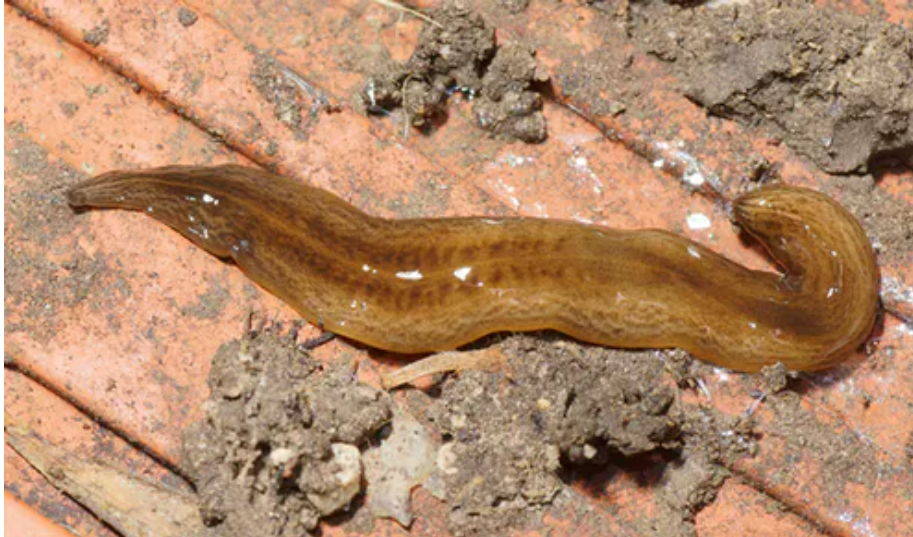
Obama nungara in a garden in France.

L'expertise universitaire, l'exigence journalistique