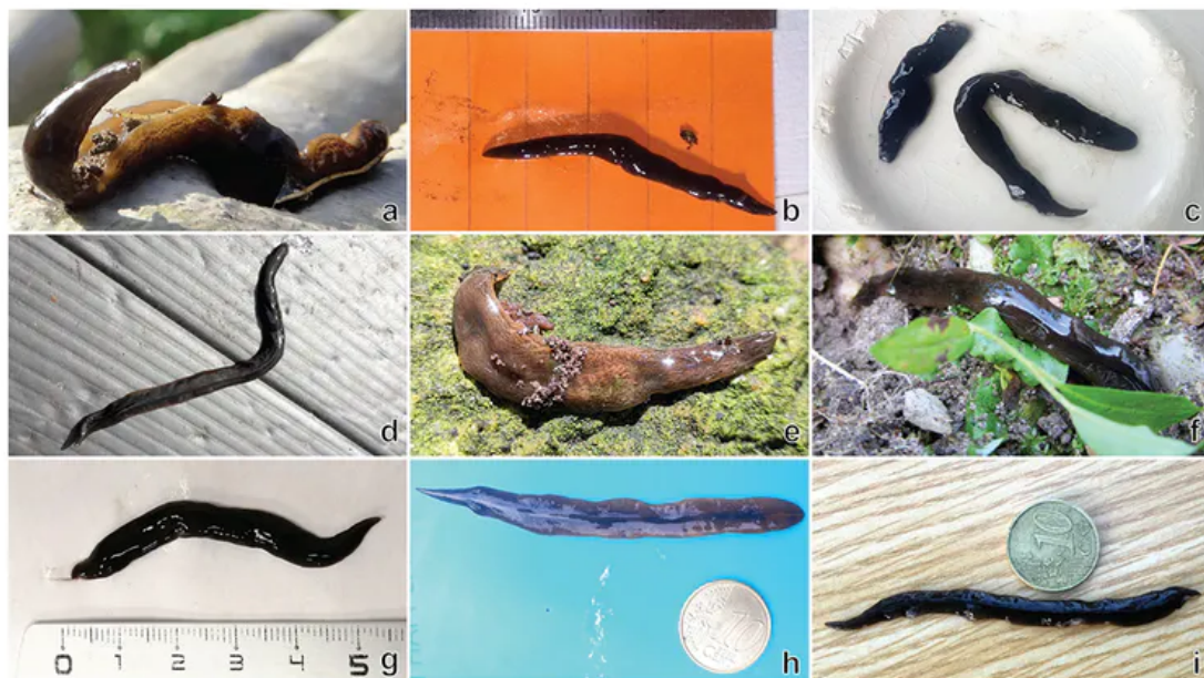
Citizen science: photographs of Obama nungara sent by non-professionals from many places in France. Various authors, layout by Jean-Lou Justine

invasive terrestrial flatworms possibly pose a greater threat to the soil fauna.