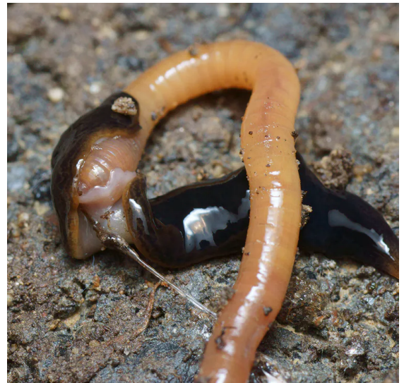
Obama nungara killing and eating an earthworm. by Pierre Gros

Scientists will continue to map the distribution of the flatworm, and the help of citizen scientists with this task is crucial. To better assess the ecological impact of Obama nungara , we will now try to determine the full spectrum of prey it consumes.