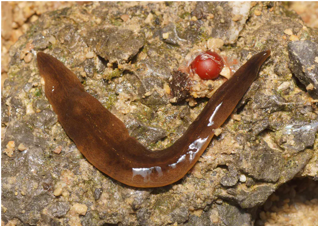
Adult Obama nungara and its cocoon, which is reddish at first then turns black.

Importantly, Obama nungara has no natural enemies in Europe. While these soft-bodied terrestrial flatworms may seem to be fragile, they are protected by secretions containing a sophisticated chemical arsenal that generally makes them repugnant to potential predators such as birds.