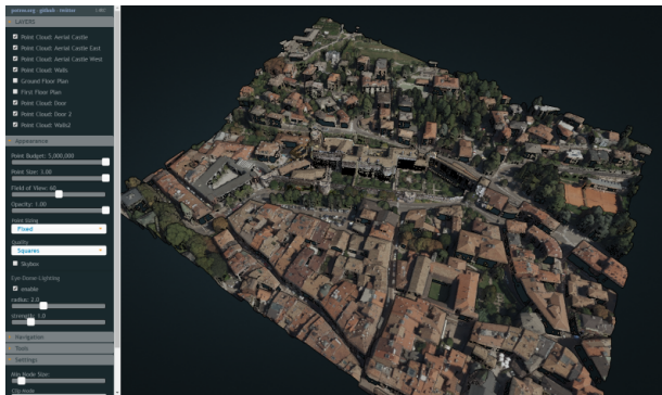
Figure 3a: The initial visualization with the castle and the surrounding urban area

For the visualization of dense point cloud datasets, the Potree<sup>1</sup> WebGL open source viewer (version: 1.4RC) was used. This solution (i.e. point-based rendering) has the main advantage of being specifically developed for rendering large point clouds using standard web-based technologies that work within a web browser.