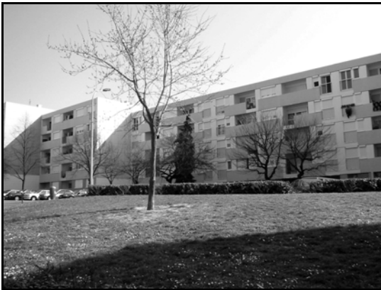
Picture 3 – A public space in the estate