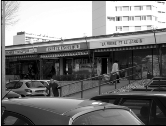
Picture 1 – A main centre of the estate with shops

La Ville Nouvelle housing estate in Rillieux-la-Pape, Greater Lyon