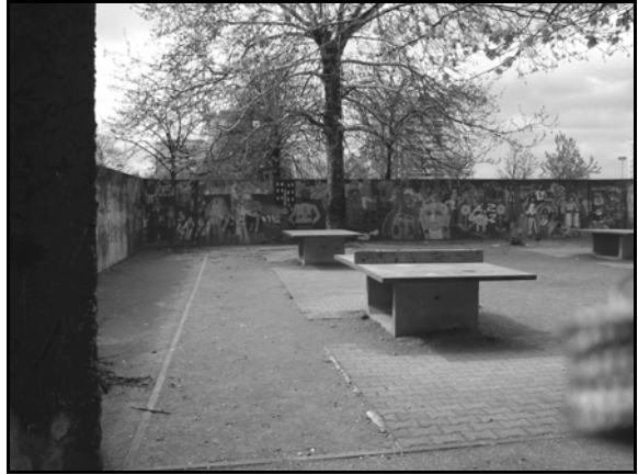
Picture 13 – A public space in the estate (Photo: Marcus Zepf, 3-4-2003)