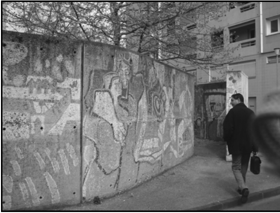
Picture 9 – A typical entrance of a large building from outside (Photo: Marcus Zepf, 3-4-2003)