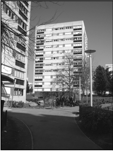
Picture 5 – Typical entrance of a large building from outside