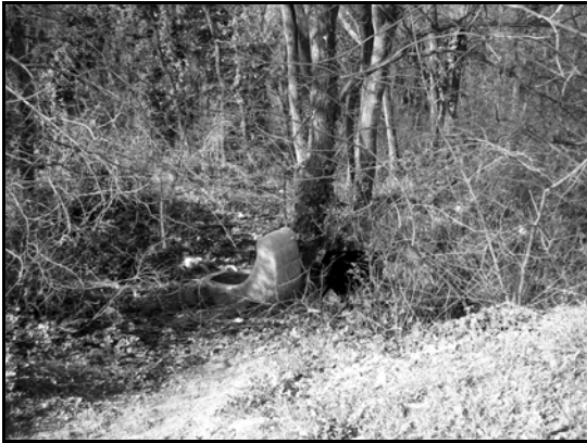
Picture 7 – A typical garbage place