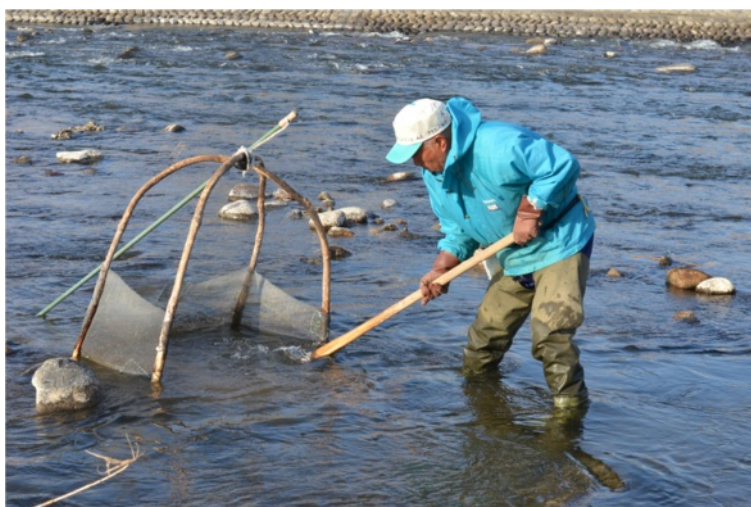
Fig. 2 Fishing zazamushi in the Tenryū River.

Before being sold as souvenirs, zazamushi were mainly collected and consumed by locals of the Tenryū River. The reconstitution shows two phases in the trade: a first phase when the zazamushi were collected and sold locally [34], then a second which saw the arrival of packaged insects. The sale of zazamushi as food souvenirs developed starting in 1956 when the Ina-based company Kaneman (closed in 2011) offered preserved zazamushi