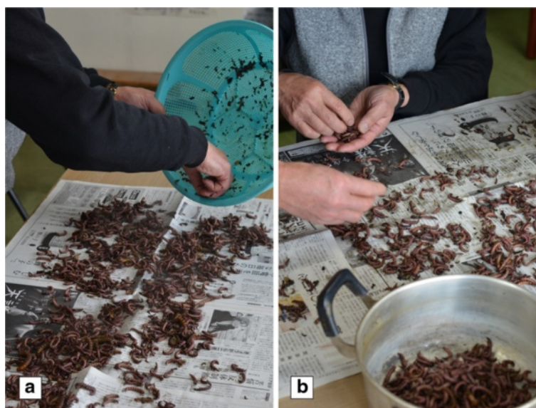
Fig. 5 Processing zezamushi: a after boiling and cleaning, the insects are spread to be sorted a final time by size and quality, b the insects still contain small debris and detritus.

stones in particular has prompted the fishermen to use other tools, such as the hoe and to develop new techniques for gathering and sorting, such as the grading sieve. Indeed, if the use of the four-hand net in riffles has multiplied the quantity of insects caught, it has also had the collateral consequence of increasing the amount of “trash” collected, including many insects other than the target species.