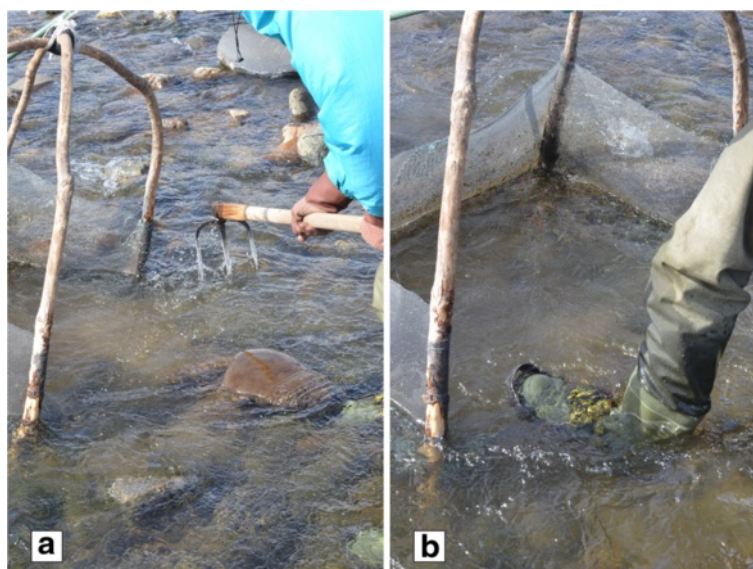
Fig. 3 Fishing zazamushi: a turning stones upside down, b “trampling” the riverbed with metal shoes.

A fisherman progresses through a few square meters of the river in this way each day and can prospect an area of about 20 square metres in a morning, if the stones are not too large and if the weather conditions are good, or over a full day if the weather is bad and the stones are large. If the site promises more abundant catches, the fisherman will come back the following day, slightly upriver from where he had prospected the previous time. At the end of a rapid, or of a section of river, the fishermen follow parallel lines to either side of the main line of the rapids. Once the rapids of a site have been prospected, the fishermen change site and don't come back to this one for the rest of the season.