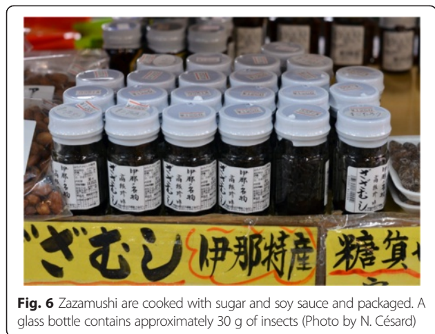
Fig. 6 Zizamushi are cooked with sugar and soy sauce and packaged. A glass bottle contains approximately 30 g of insects

various elements received have been modified and adapted by the new owner. The metal equipment such as the four-hand net, metal shoes and graders, are made by the fisherman or commissioned from craftsmen. Thus, it is common for a fisherman's idea for improving his own equipment to be taken on by another.