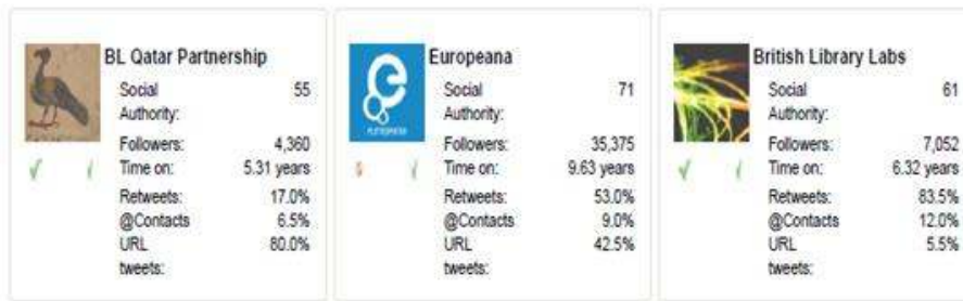
Figure 1. Summary of Tweeter details