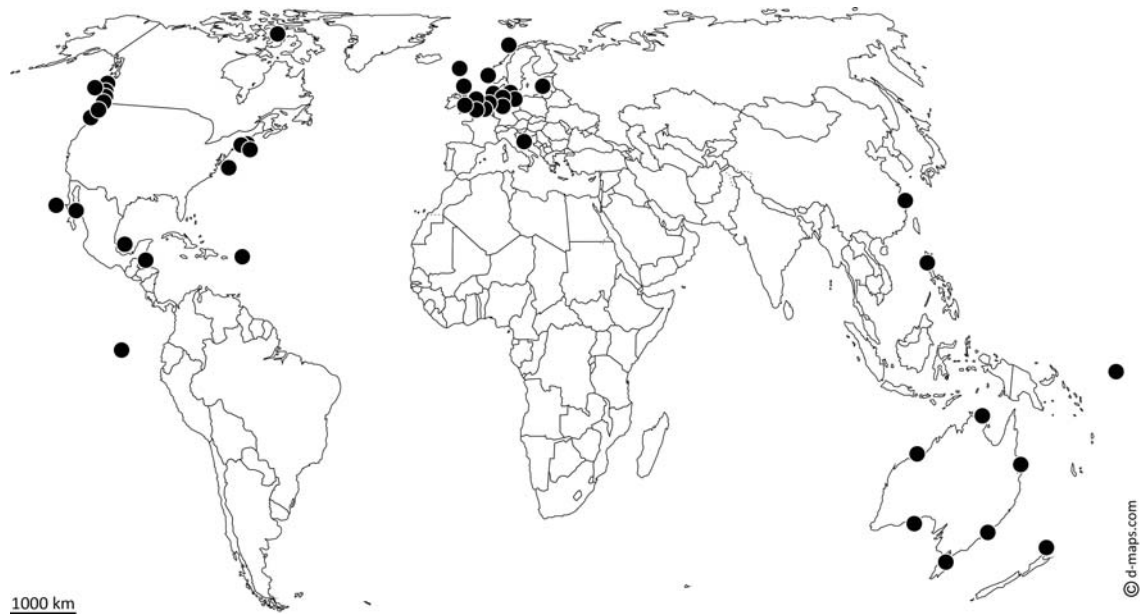
827 Figure 1. Distribution of the 44 MSP initiatives analysed