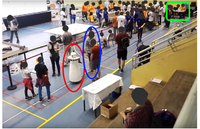
Fig. 3. RobAIR (red) following a person (blue) who was instructed to take RobAIR to a destination (green).

2) Results : Using setting 0 (beside), the robot would turn to the right in order to position itself on the right hand side of the person relative to their direction of movement. Very often, participants started moving towards the same direction, somewhat mirroring the robot’s change in direction of travel. This resulted in the robot moving even further to the right, given that now it was predicting that the person would keep moving to the right. This often resulted in the person-robot pair going in a completely different direction to what was required to reach the destination. This was observed with all participants using setting 0 . Participants were always surprised when told that the robot was trying to position itself at their side at the end of the experiment. Some participants