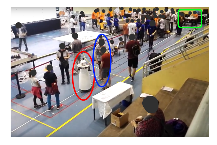
Fig. 3. RobAIR (red) following a person (blue) who was instructed to take RobAIR to a destination (green).

2) Results: Using setting 0 (beside), the robot would turn to the right in order to position itself on the right hand side of the person relative to their direction of movement. Very often, participants started moving towards the same direction, somewhat mirroring the robot's change in direction of travel. This resulted in the robot moving even further to the right, given that now it was predicting that the person would keep moving to the right. This often resulted in the person-robot pair going in a completely different direction to what was required to reach the destination. This was observed with all participants using setting 0. Participants were always surprised when told that the robot was trying to position itself at their side at the end of the experiment. Some participants