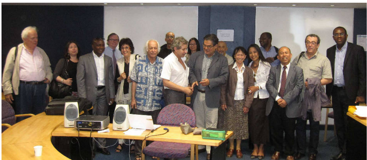
Photo de famille. On y voit aussi des participants non intervenants.