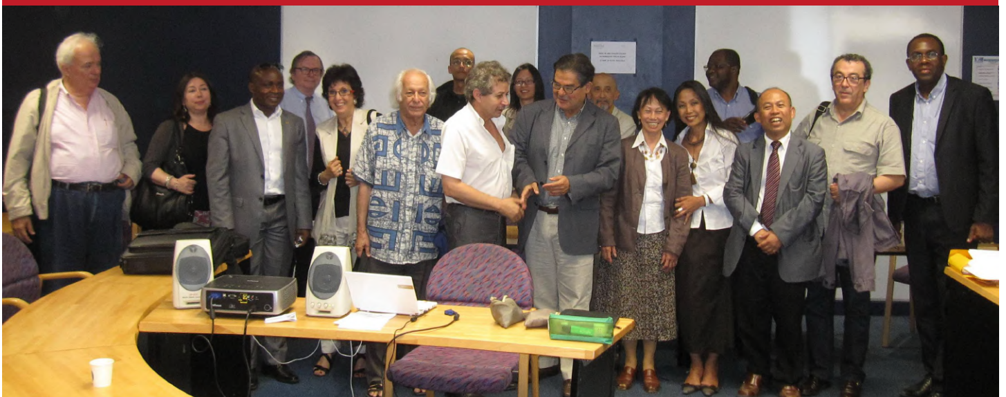
Some of the presenters and participants of the seminar